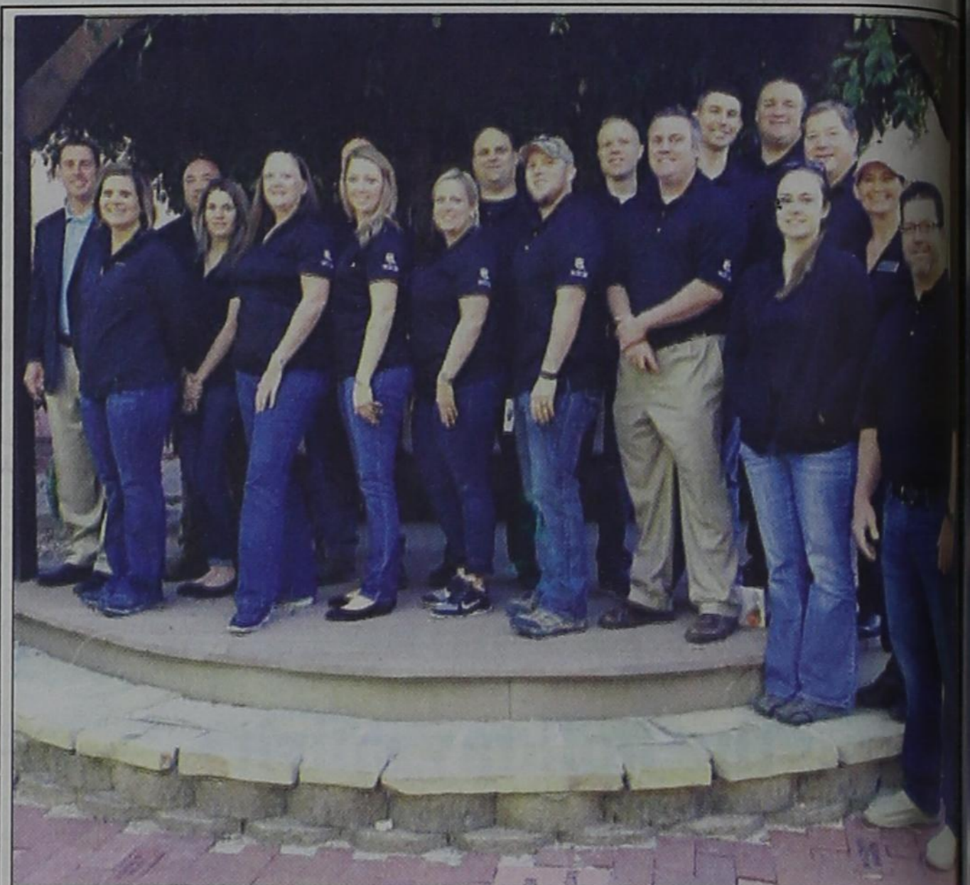
Members of Leadership Rockwall, pictured above, have pledged to create a landscaped area, a "refuge of Rockwall," for those served by Women in Need and the Children's Advocacy Center. The group has pledged to raise at least $24,500 for the project, which will be located at 1350 E. Washington St. It will serve children who have been abused or neglected, as well as victims of domestic violence.