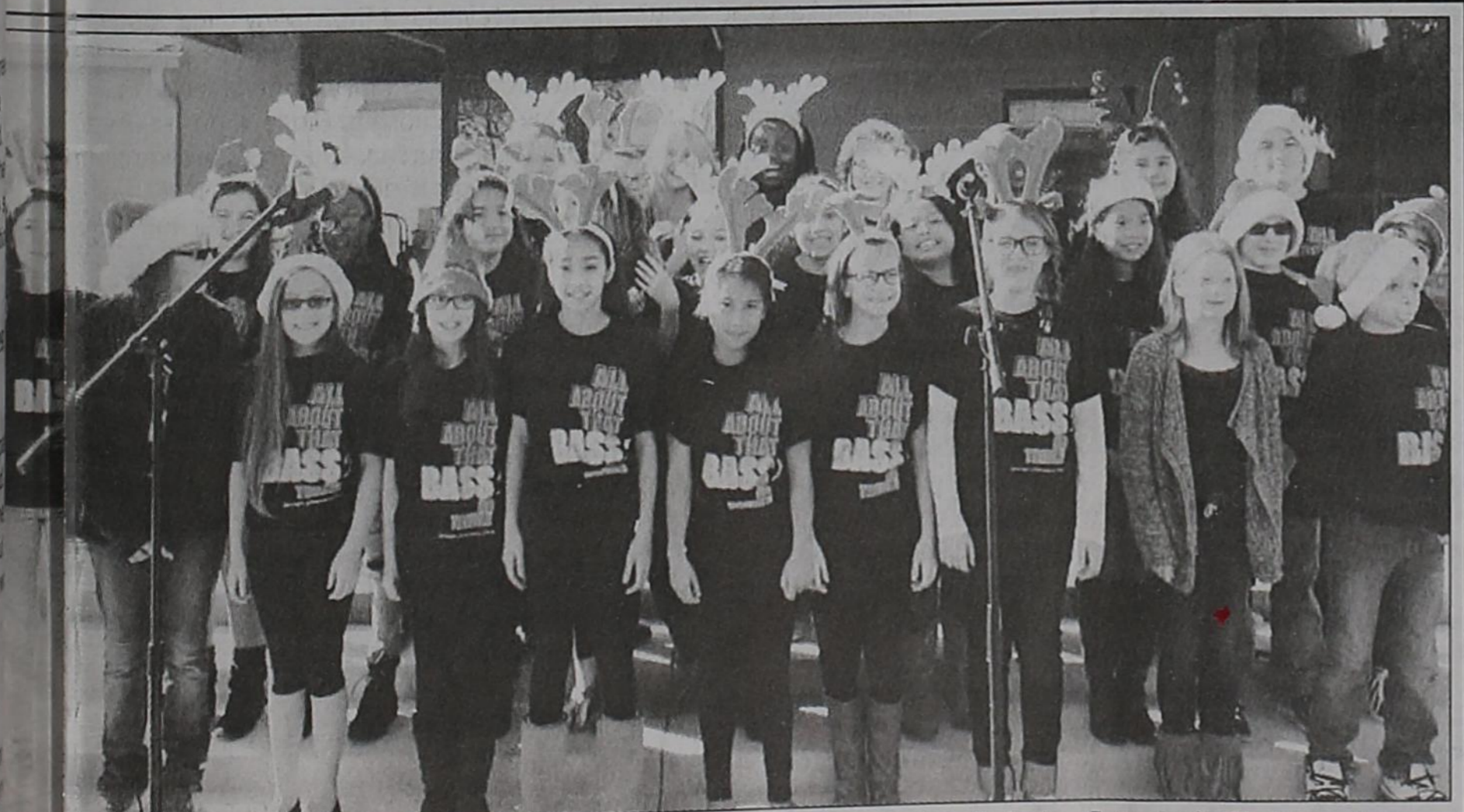
Members of the Springer choir were chosen to perform in downtown Rockwall during Saturday's Christmas tree ceremony. Pictured above are choir members preparing for their performance.

And that's okay, because we do have the things we really need. Right here. Hanging on the branches of our tiny tree.