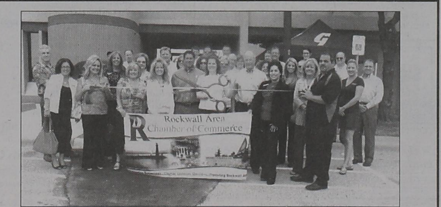
Rockwall Chamber of Commerce welcomes Guaranty Bond Bank Friday September 27, 2013

Thank you to Texas Health Presbyterian for lunch and taking us on a tour of your new Emergency Room located at 2265 N.Lakeshore Drive in Rockwall. The facility is large and well appointed with such a friendly staff. It is dedicated to serving the residents of North Rockwall and surrounding communities with a significantly smaller wait time.