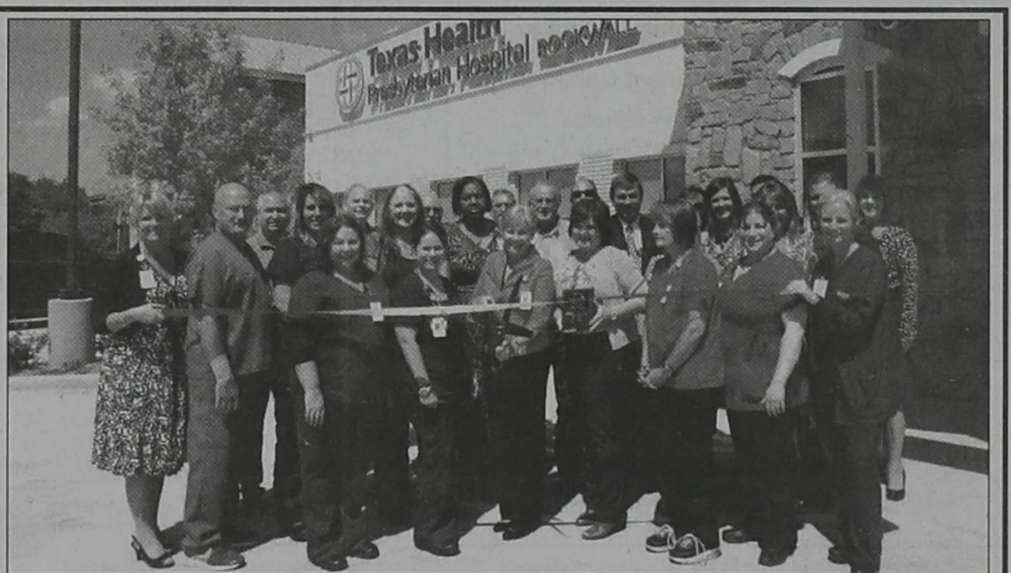
Rockwall Chamber of Commerce welcomes Texas Health Presbyterian Hospital Emergency Room Friday August 30, 2013

Thank you to Texas Health Presbyterian for lunch and taking us on a tour of your new Emergency Room located at 2265 N.Lakeshore Drive in Rockwall. The facility is large and well appointed with such a friendly staff. It is dedicated to serving the residents of North Rockwall and surrounding communities with a significantly smaller wait time.