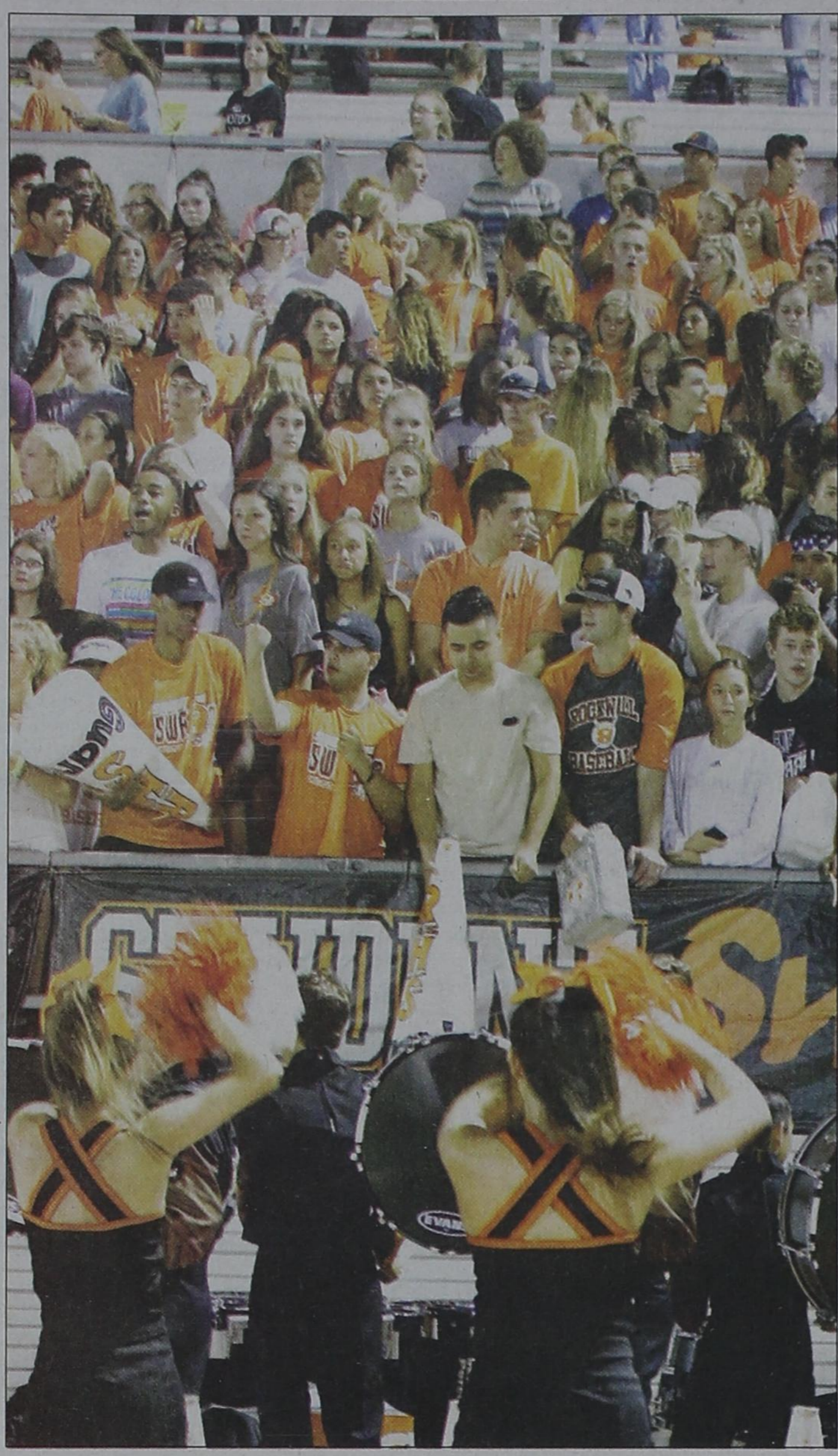
The Rockwall High School cheerleaders lead the student section in cheers as the Yellowjackets varsity football team pushed the strong Southlake Carroll to it's limits, Fri. Sept. 9, 2016, at Wilkerson-Sanders Stadium in Rockwall. The Jackets fell to Carroll 30-23 in a close game. Rockwall will begin District play, 7:30 p.m., Fri. Sept. 16 against Tyler HS at Tyler Rose Stadium in Tyler.