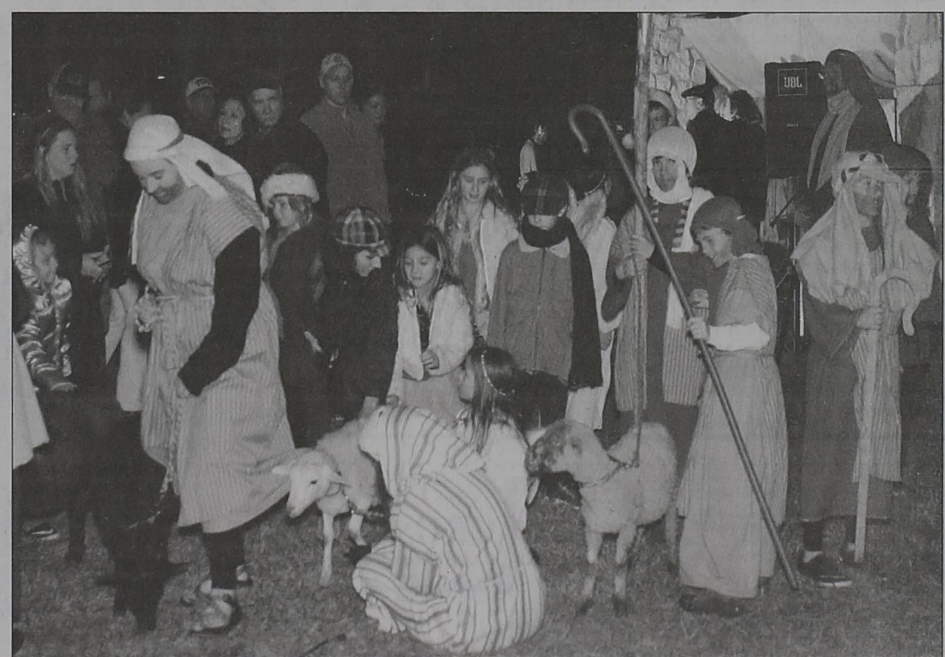
Children enjoyed petting farm animals and visiting with the people who performed the 10th annual First Christian Church "The Living Nativity," Sun. Dec. 20, 2015 in Rockwall.