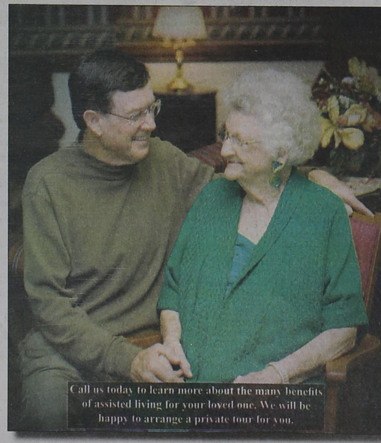
Call us today to learn more about the many benefits of assisted living for your loved one. We will be happy to arrange a private tour for you.

The pickles are made from an old family recipe passed on to Duckworth by an aunt. The sweet and zesty jalapeño peppers is a new