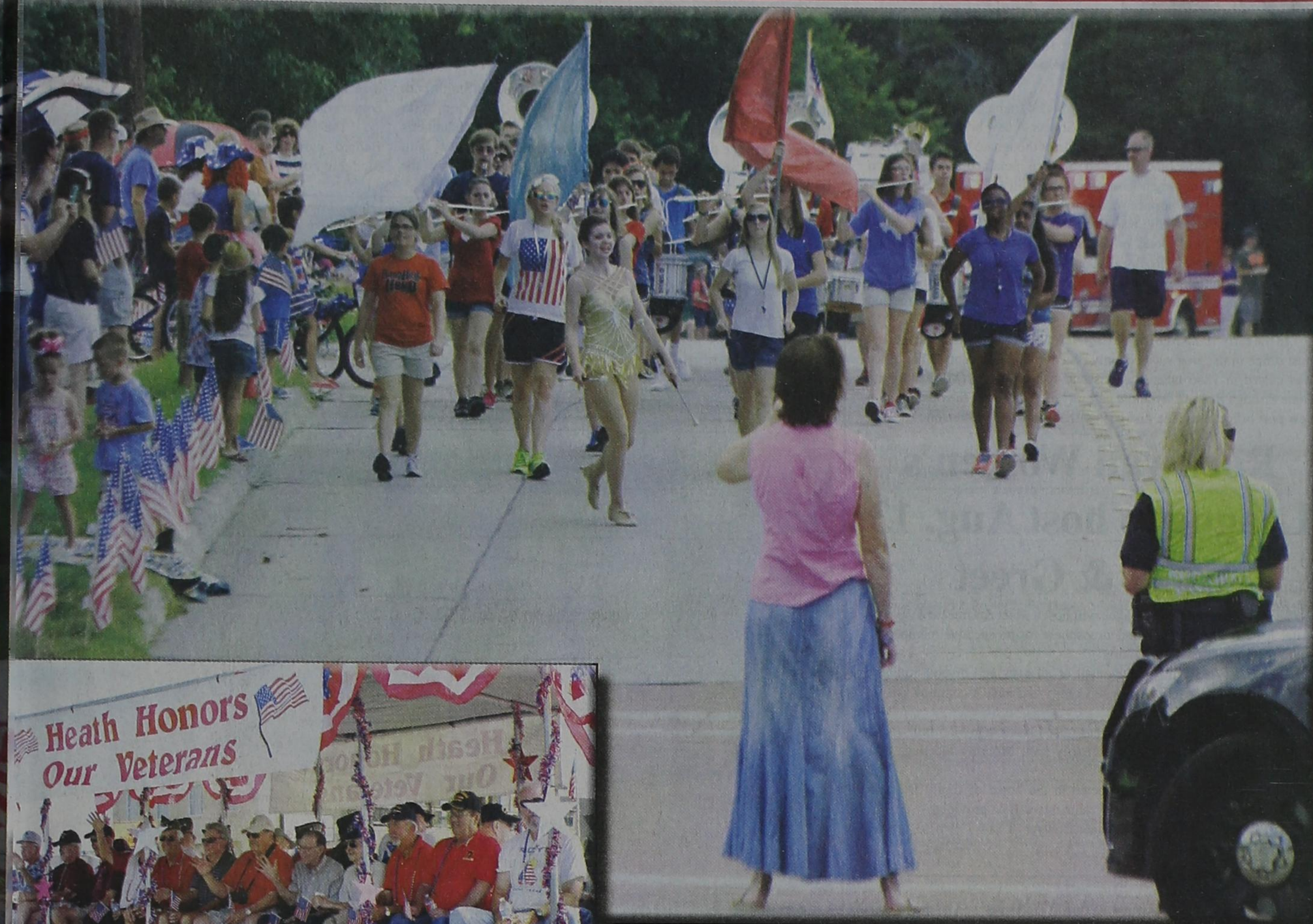
The Rockwall High School 'Orange Wave' Marching Band approaches Clark Street from Boydston Street while playing lively marches for patriotic onlookers of all ages, Friday July 4, during the Rockwall Independence Day parade.

Volume Number 28 • Issue Number 28 • USPS 002-495 • Thursday, July 10, 2014 • Single Copy Price 75 Cents • Copyright 2014 Rockwall County News