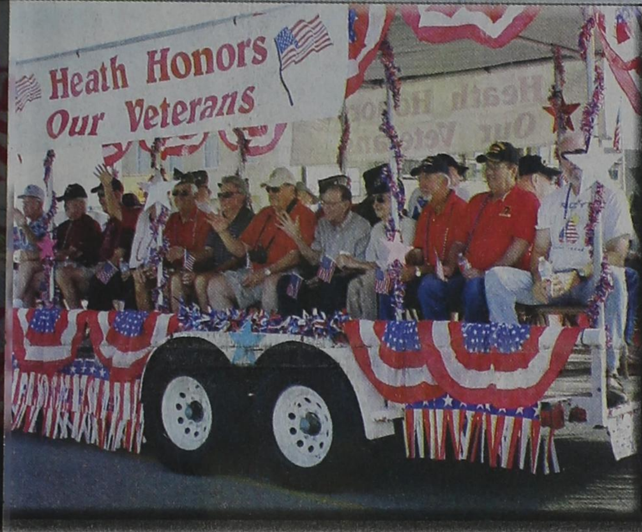
Red, white and blue covered the streets of Heath as hundreds of residents and guests alike lined the street for Heath's Annual Independence Day Parade on Friday, July 4. The parade honored area residents who have served in the Armed Forces.