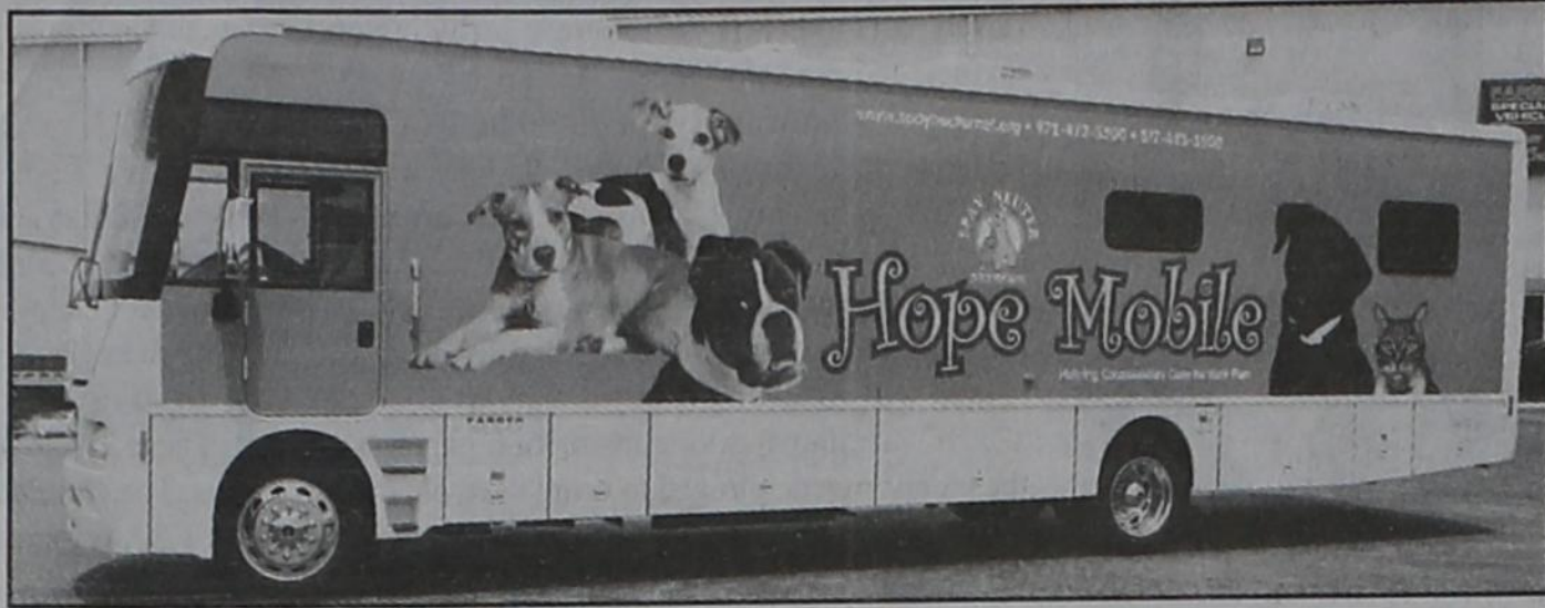
Spay/neuter shuttle services that once were provided to local pet owners will be changed to provide on-site services in the 45-foot spay/neuter bus pictured above. A pet owner who makes an appointment will have his/her pet spayed or neutered aboard the bus, which will be located in the I-30 Wal-Mart parking lot July 23 and Aug. 20. Procedures will be offered at discount prices. For more details or to make an appointment, call 972-472-3500.

Network, the same services now will be provided on site in Rockwall. Under the new arrangement, the Hope Mobile, a 45-foot spay/neuter bus, will park in the I-30 Wal-Mart parking lot for one day a month.