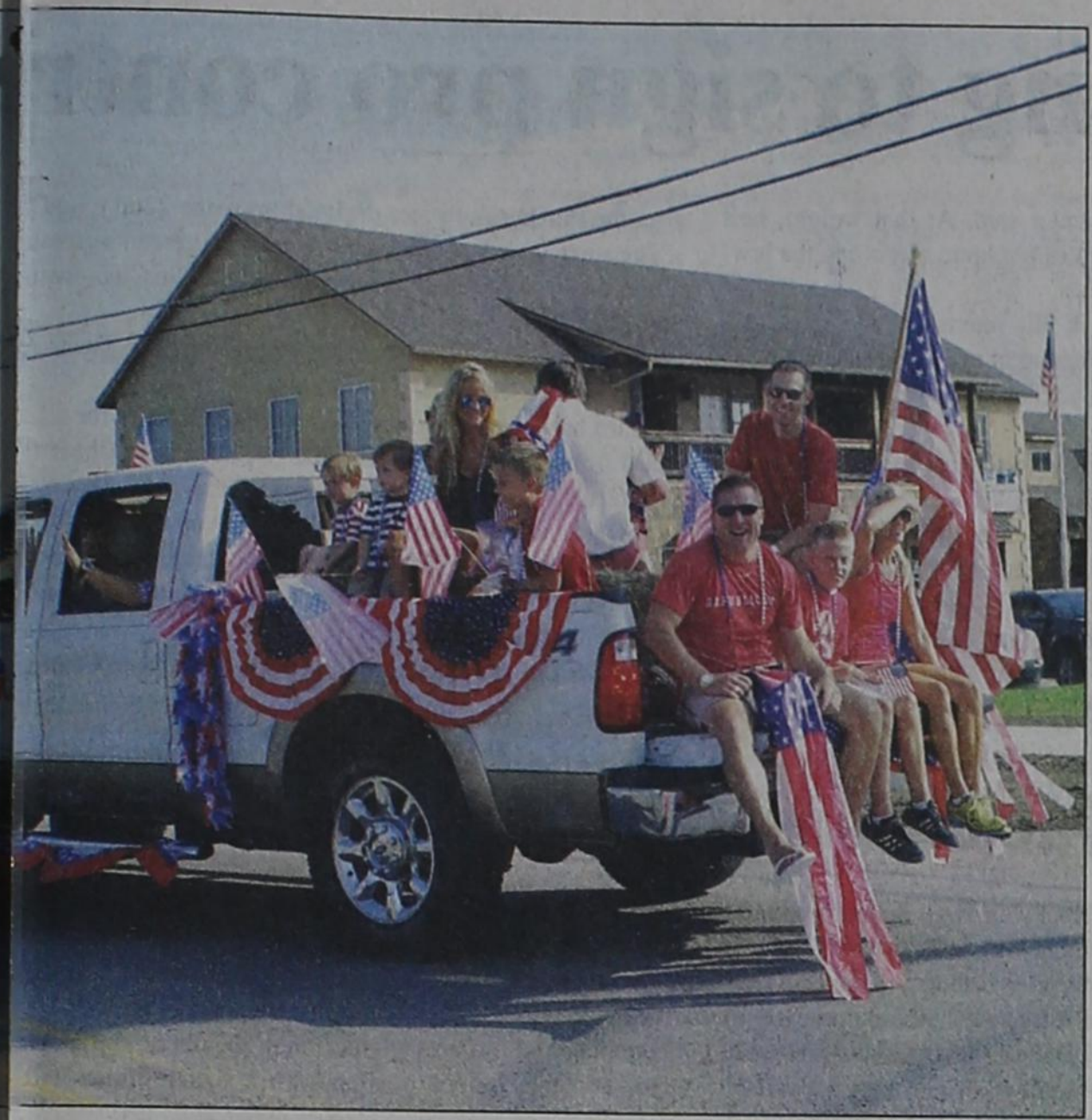
The Rockwall County Republican Party's float won the award for most community spirit at the party's Annual Independence Day Parade on Friday, July 4. Prize-winning entries from the parade were given awards created and donated by Lakeside Florist.