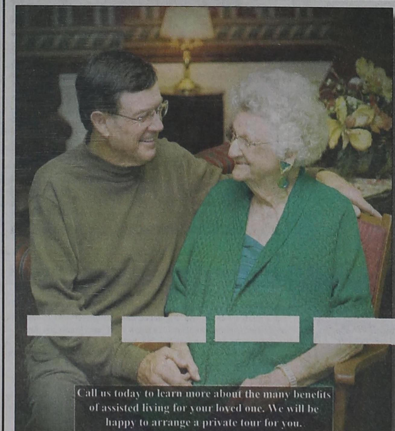
Call us today to learn more about the many benefits of assisted living for your loved one. We will be happy to arrange a private tour for you.