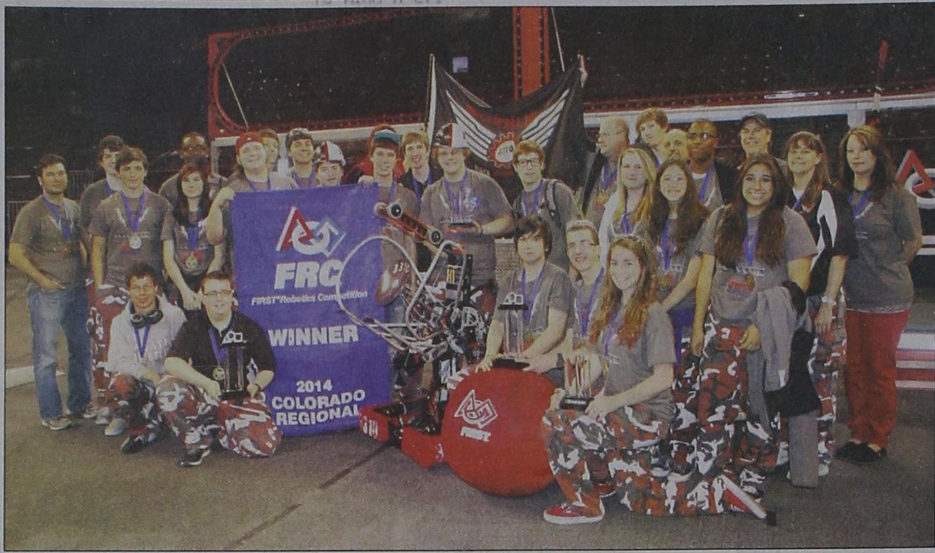
The Black Hawk Robotics Team from Rockwall-Heath High traveled to Denver, Colo., to compete in the Colorado Regional Robotics Competition April 3-5. The team, pictured above, partnered with Eagle Robotics and Titan Bots, both from California, to win the competition. The win qualified the teams to attend the world championships in St. Louis April 23-26. Only six of the 52 competing teams qualified for the world event. The Robotics Team also won the Innovation in Control Award sponsored by Rockwell Automation. To see the robot in action, visit youtube.com/watch?v=5BRuP5RbLQ (look for the robot in red bumpers with two red balls). This year's robot is unique in that it uses a crossbow to power the shooting of the ball. The intake system can easily pick up balls from the ground or the human player can toss the balls into the robot when rotated upward. The wings open up to accept the ball.