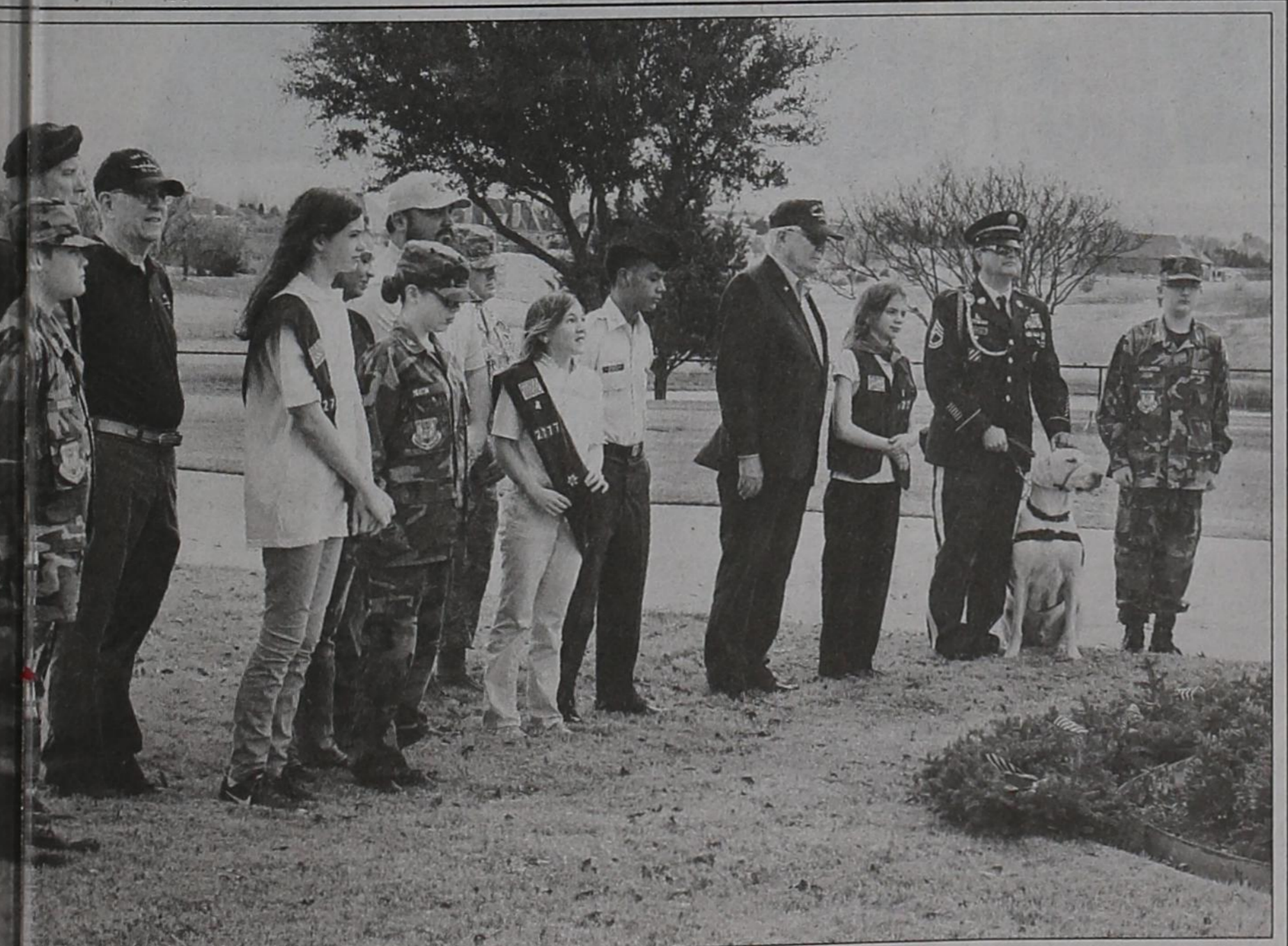
Scouts and veterans led a procession to the flagpole where ceremonial wreaths were placed, followed by a rifle volley. The activities were part of a Wreaths Across America event conducted Saturday, Dec. 17, at Resthaven Funeral Home in Rockwall.