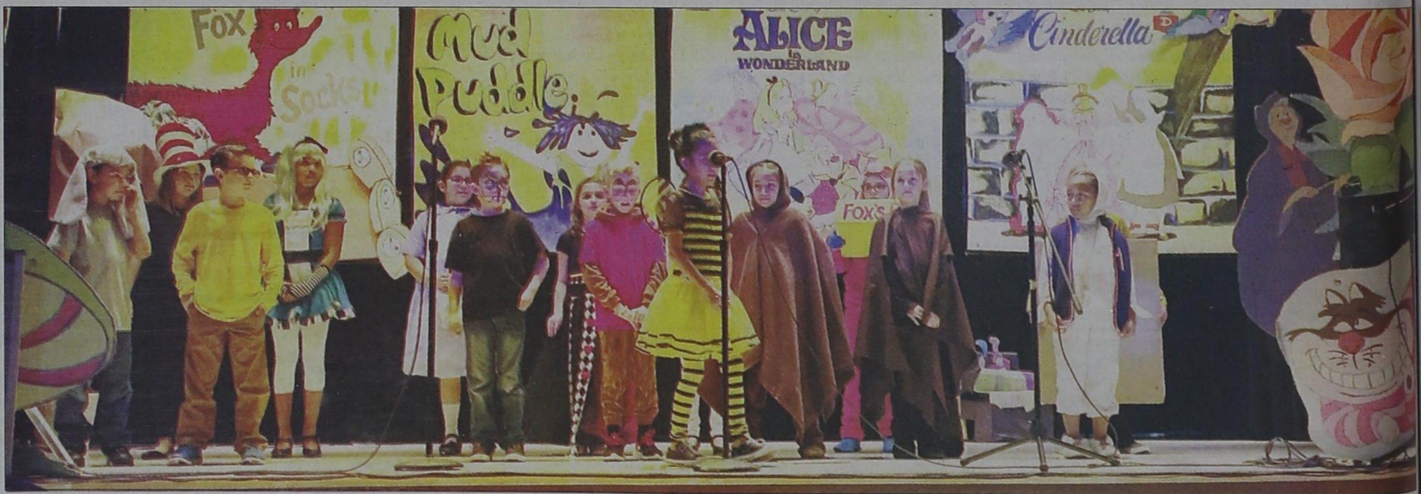
Third grade students at Springer Elementary recently presented "Open a Book," a magical and musical ride through children's storybooks that featured such works as Dr. Seuss, "Mudd," "Cinderella," "Alice in Wonderland" and others.