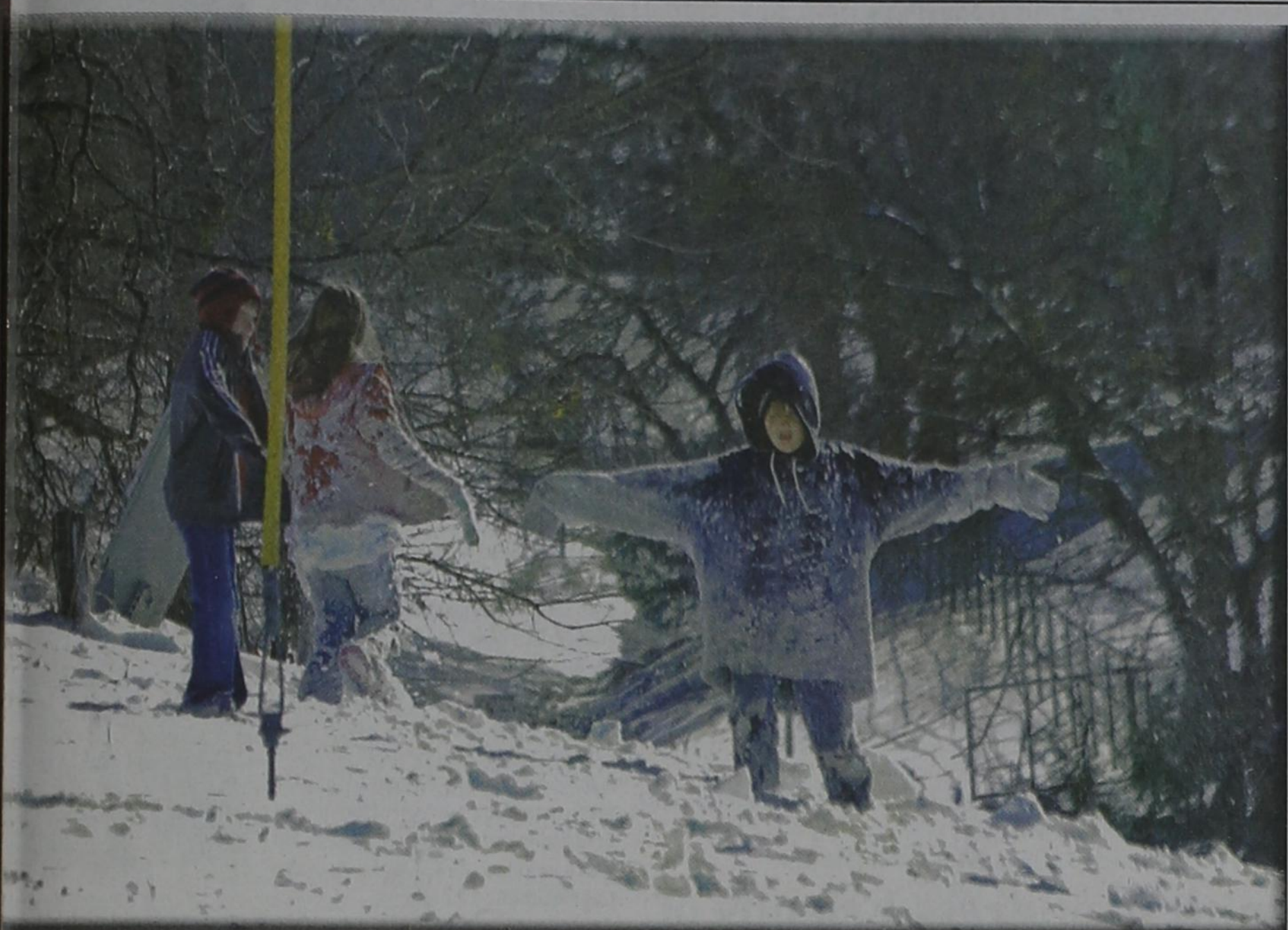
Nearly four inches of snow brought Rockwall ISD and Roysse City ISD schools to a stand-still Thurs. March 5, opening the day up for fun in the snow and shining sunlight.

Volume Number 29 • Issue Number 11 • USPS 002-495 • Thursday, March 12, 2015 • Single Copy Price 75 Cents • Copyright 2015 Rockwall County News