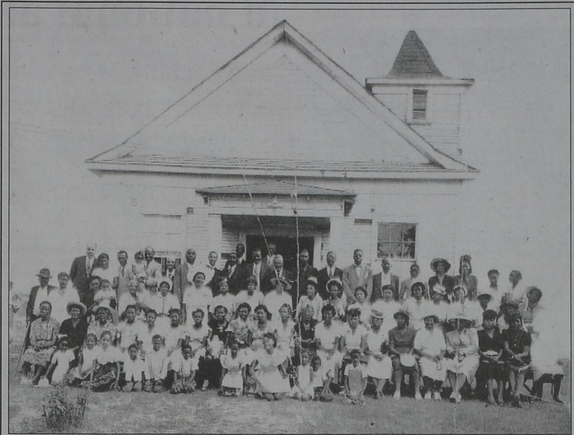
This photo shows the New Hope Baptist Church in Roysse City in 1948. The original church was formed in 1859 by former slaves who moved to the area. They built a brush arbor as their first meeting place.