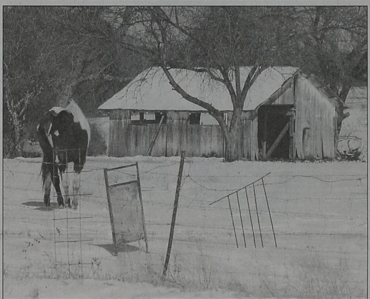
This good ole' horse pranced and moved about for the photographer in the north side of Rockwall County on FM 552, Thurs. March 5, after the over-night snow event that covered north Texas.