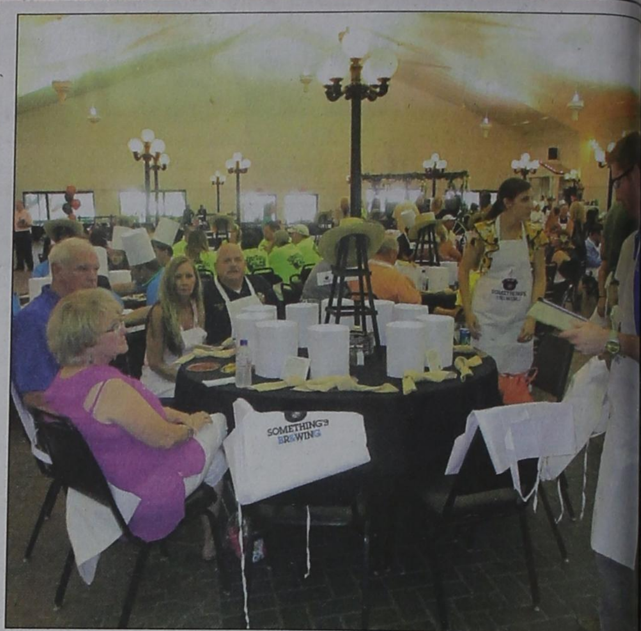
The main ballroom at the South Fork Ranch in Allen was full Aug. 10 with representatives from Fate, Heath, Rockwall, Rowlett and Roysse City. The Boys and Girls Clubs of Rockwall Iron Chef Challenge sponsored the four-hour event. Shown at the front table are Fate City staff and family members. The event included an announcement that a new Boys and Girls Club for Rockwall County will be built on 45 acres in Fate at Hwy. 551 and I-30. It will include a center, a wellness center and a sports complex.

Lake Pointe Medical Center is partly owned by physicians and meets the definition of Physician-owned hospital as specified in 42 CFR 489.3. For a list of physician investors, please visit our website at www.LakePointeMedical.com.