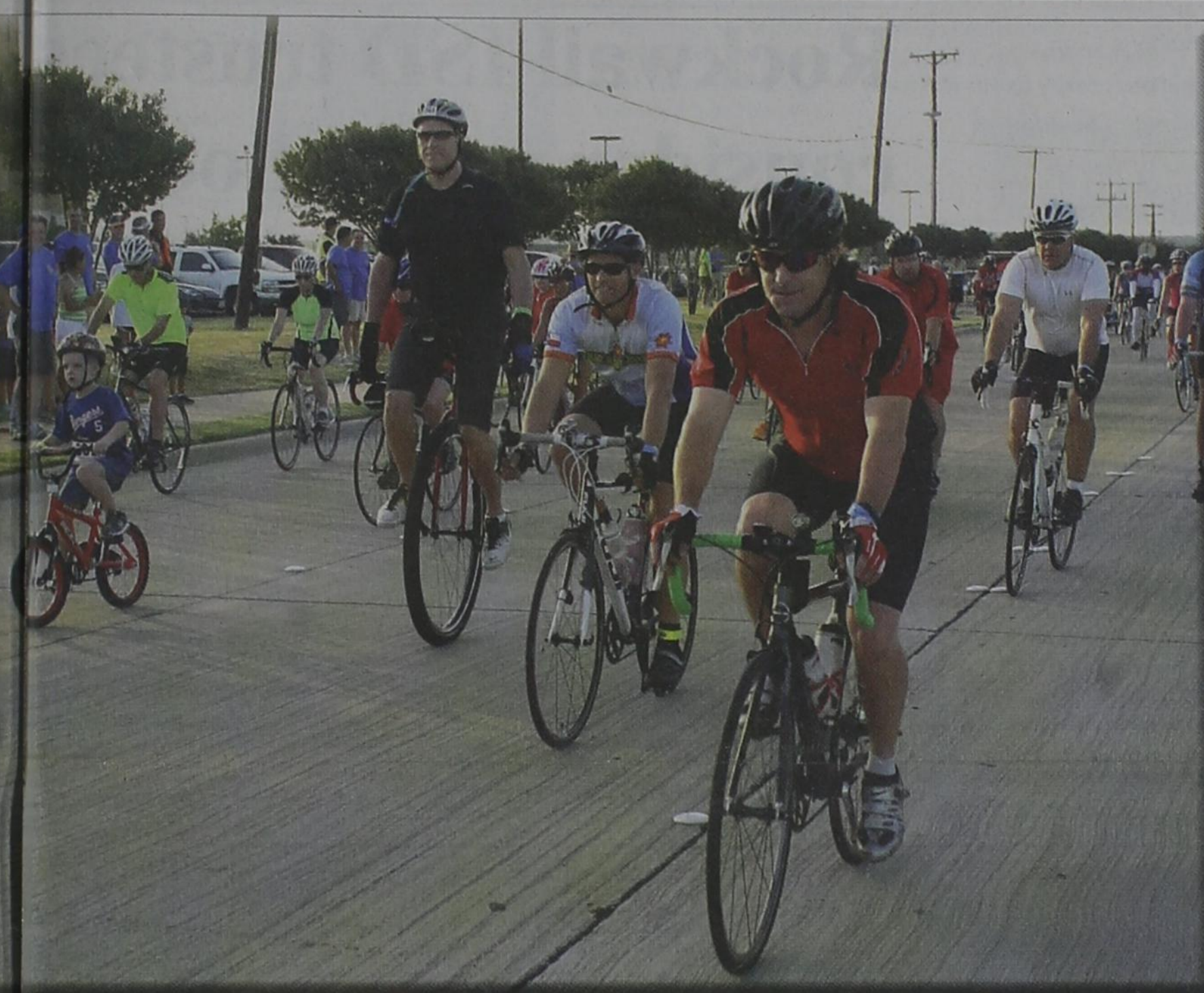
Children and adults start "The Ride for Families that Rock" Hot Rocks Bike Ride, Saturday August 10, on Townsend Drive in front of Willson-Sanders Stadium in Rockwall. Races included 100K, 40 miles, 23 miles, 13 miles, 6 miles and 3 miles.