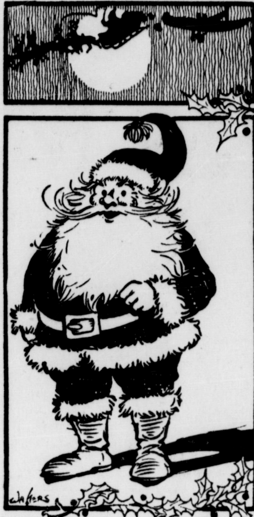
"Your Uncle Santa is Getting Fat."

Odell's Headquarters for Santa Claus this Season.