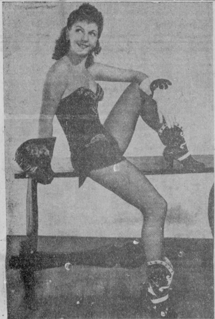
GLAMOROUS MARY MARTIN, the Texas gal who soared to stage and screen fame, will star in the forthcoming mammoth production of the Broadway hit musical show, "Annie Get Your Gun," at the State Fair of Texas, October 4-19. She will play the role of Annie Oakley, famous sharpshooter of the Nineties. The State Fair is bringing this show to Texas at a fabulous cost exceeding $200,000.

To produce more goods for all the people, rather than deplete the goods already produced, should be every statesman's goal.