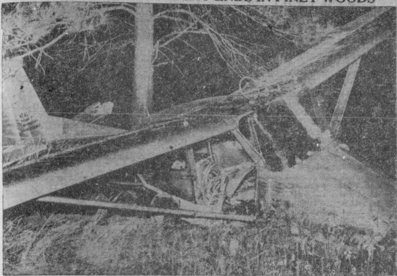
"Miss Texas," the light plane in which Pred Vinmount and Bert Simons hoped to establish a new world flight endurance record, nestles under a pine tree near Longview, Texas, after 22 days of continuous flight. The flyers were forced to crash land, 200 hours short of a record, when the plane's motor "froze up." Both men escaped with only minor injuries.

be able to take the educational qualifying examination when the Air Force team arrives in Abilene, Captain Hall said. Arrangements for an interview with the team may be made through the local Recruiting Station.