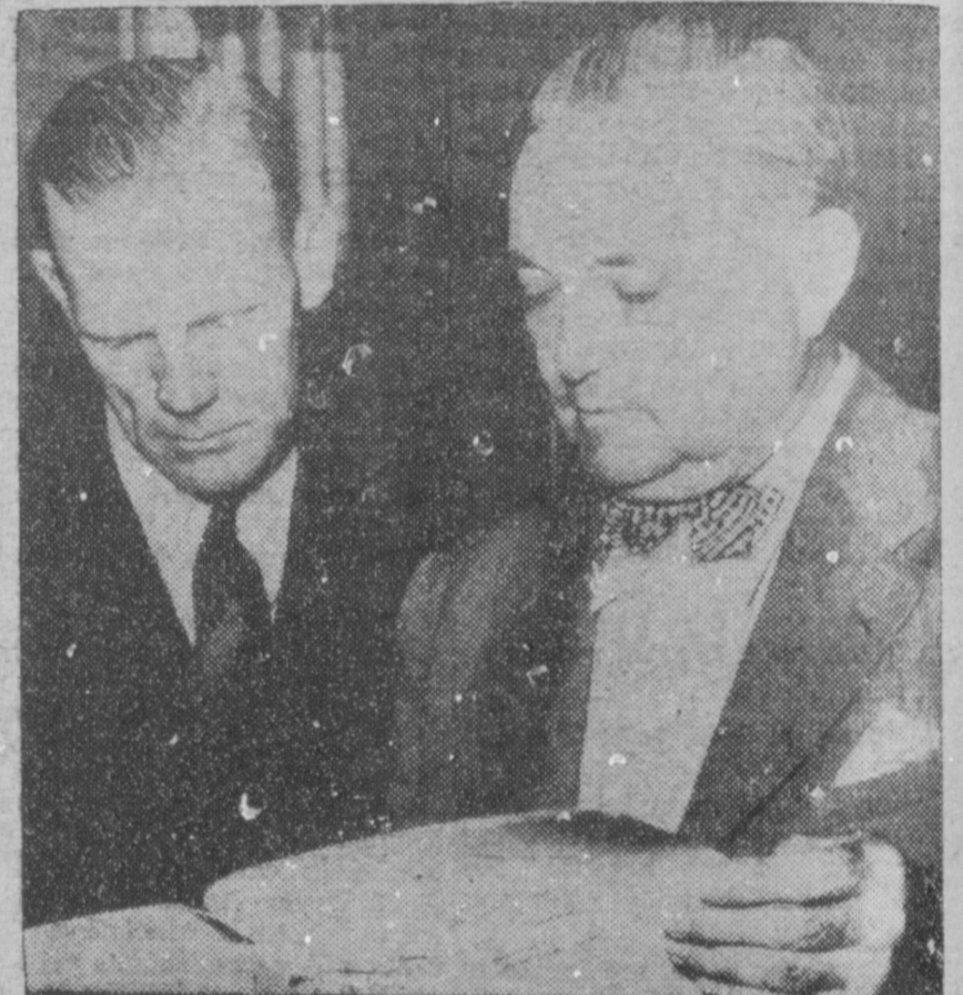
Robert "Red" Rolfe, left, Detroit Tiger head scout, has been named to manage the Tigers for next season. At right is William Evans, Tiger general manager.