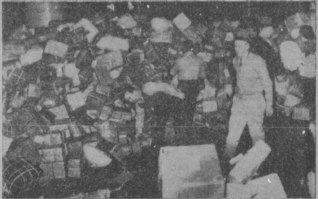
Packages form a small mountain as they pile up in the Boston, Mass. Army Base Post-office due to the Longshoreman's strike on the east coast. The strike has virtually crippled east coast shipping and rail-roads have embargoed some shipments. Many of these packages are Christmas gifts for servicemen overseas.