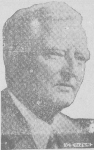
JOHN N. GARNER

Texas' distinguished favorite son—John N. Garner, the only Democrat to have announced unqualifiedly that he is a presidential candidate—is today the leading choice of his party to succeed to the Presidency.