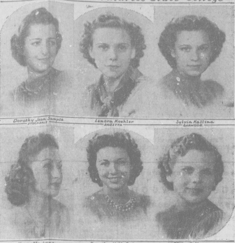
Beauty, brains, personality, and other attributes that make for popularity are requisites for which the six Southwest Texas State Teachers College co-eds pictured above were elected school favorites for the current term.