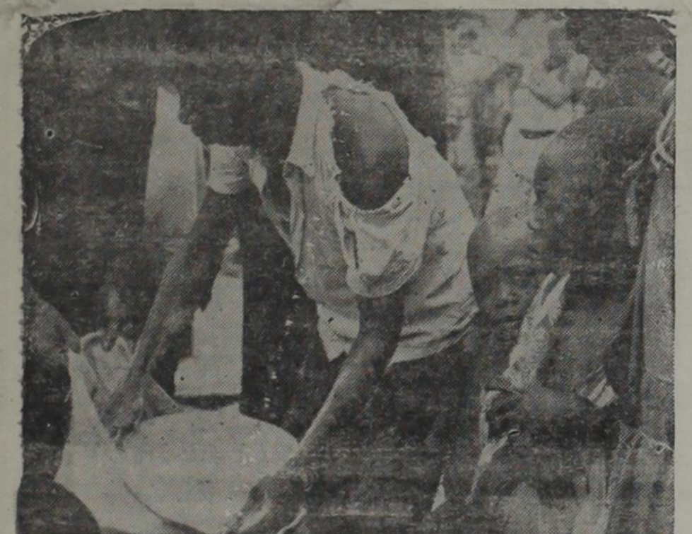
CROP started exporting food to the Congo as soon as trouble started in 1960. There were reports of more than 200 people dying of starvation daily at the end of 1960. The CROP foods, shipped through Church World Service, have been of great value in helping the people of this newly independant nation through a period of severe crisis. "Give us this day our daily bread," has great meaning for most Congolese, who look to CROP and CWS to help them stay alive.