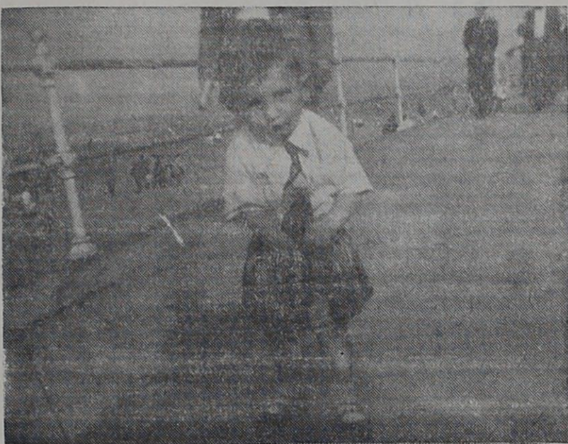
ABOVE—This little chap is dressed in the latest style and fashion in Scotland, and believe us, that is not a dress he has on, but kilts, so dear to the heart of all Scotchmen, and worn on all dress occasions by both the young and old.