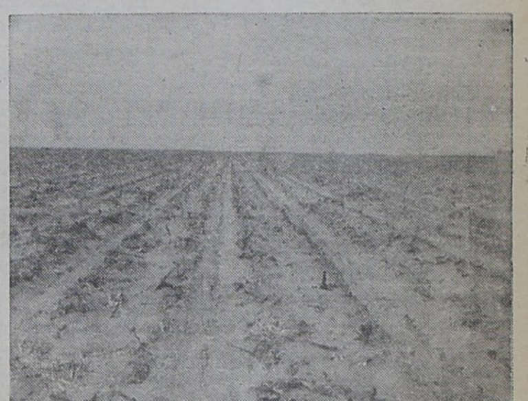
ABOVE — After the hail, the Floyd Bridwell field east of Ropes. It is not only washed level, but the cotton which was growing on it is beat into the ground.