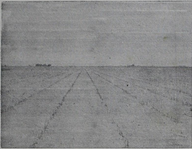
ABOVE — The Dee Strickland farm, some three miles northeast of Ropes, showing nothing had ever been planted in the field after the heavy hail of Wednesday of last week.