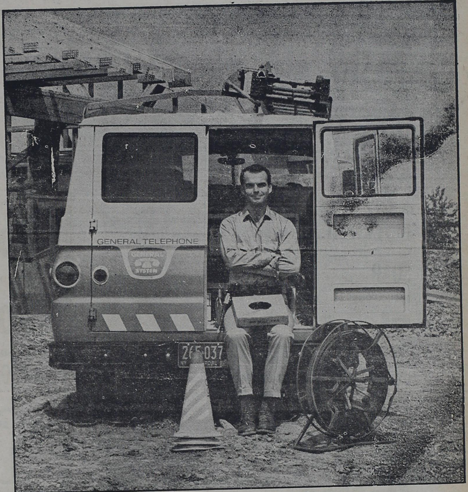
One of our busiest offices.