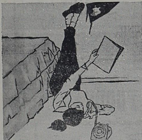
ANOTHER TELEPHONE FOR TEEN-AGERS