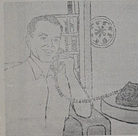
ANOTHER TELEPHONE IN THE DEN