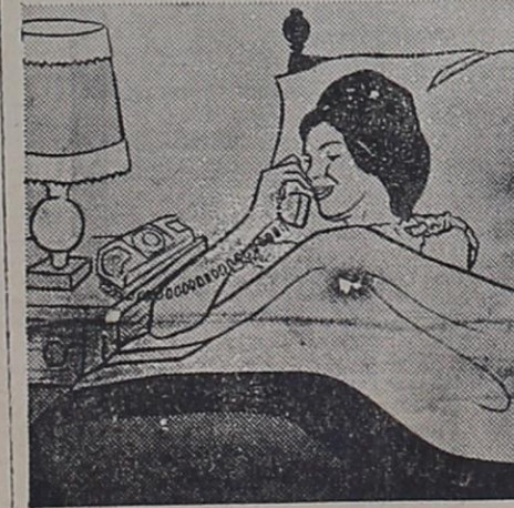
ANOTHER TELEPHONE IN THE BEDROOM