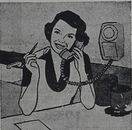
ANOTHER TELEPHONE IN THE KITCHEN

A telephone wherever you are in your home . . . this is modern living at its best . . . for you don't have to run when you have more than one! There's no need to waste time and energy when it's so easy to have additional phones in the living room, bedroom, kitchen, den or family room. Costs so little, too, just a few cents a day for this modern convenience. Choose a desk phone, wall phone, Spacemaker or the new Starlite®, in decorator colors to harmonize with any room. You've wanted additional phones for a long time, in one or more places in your home. Begin to live modern during ADD-A-PHONE MONTH. Just ask any General Telephone employee or call the Business Office. Do it today . . . NOW!