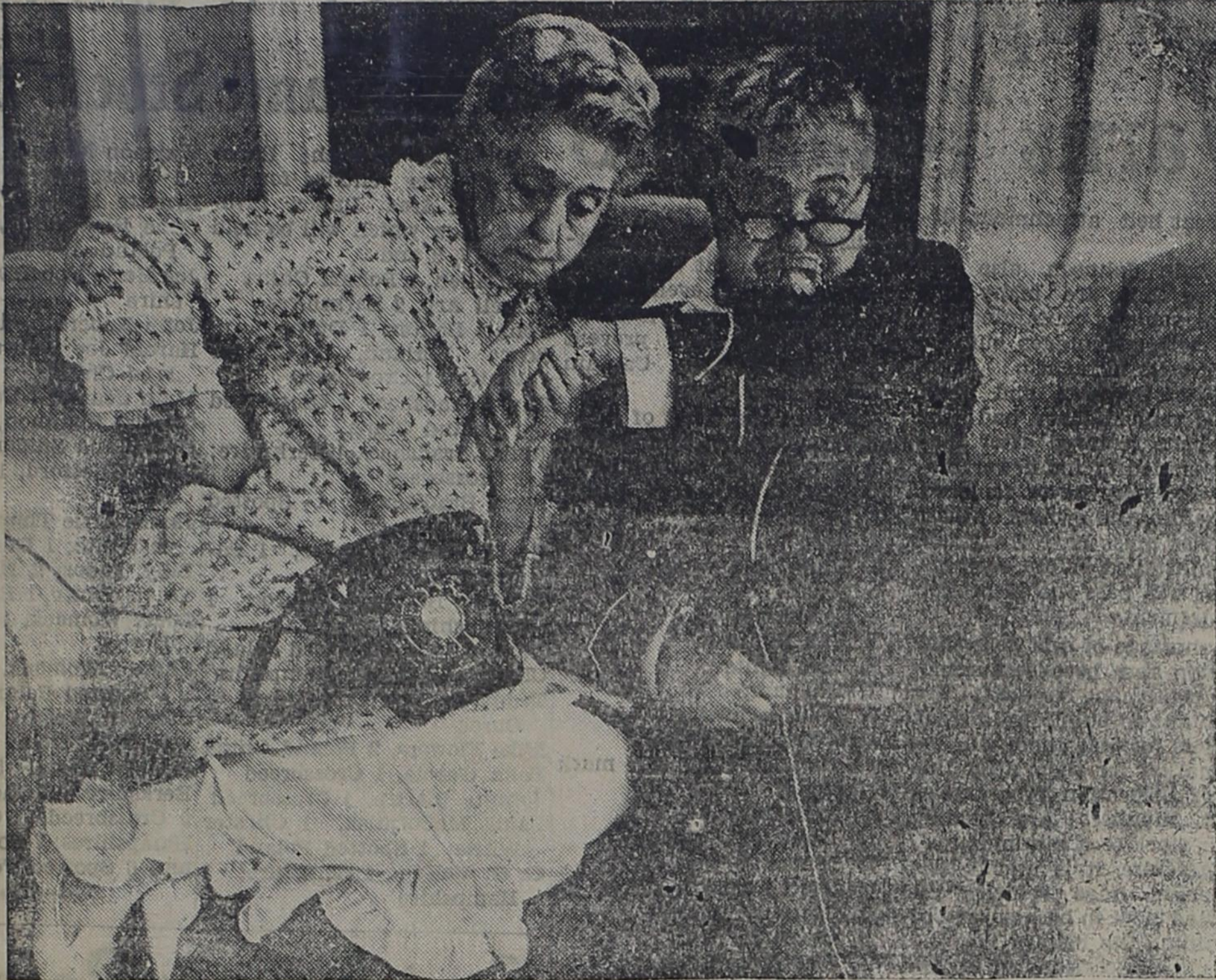
After 7 p.m., you can call anywhere in the country for a dollar.

All long distance callers worth their salt know that calling in the daytime is more expensive than calling in the evening hours. (Actually, most people call during the day, when we charge our regular rates.)