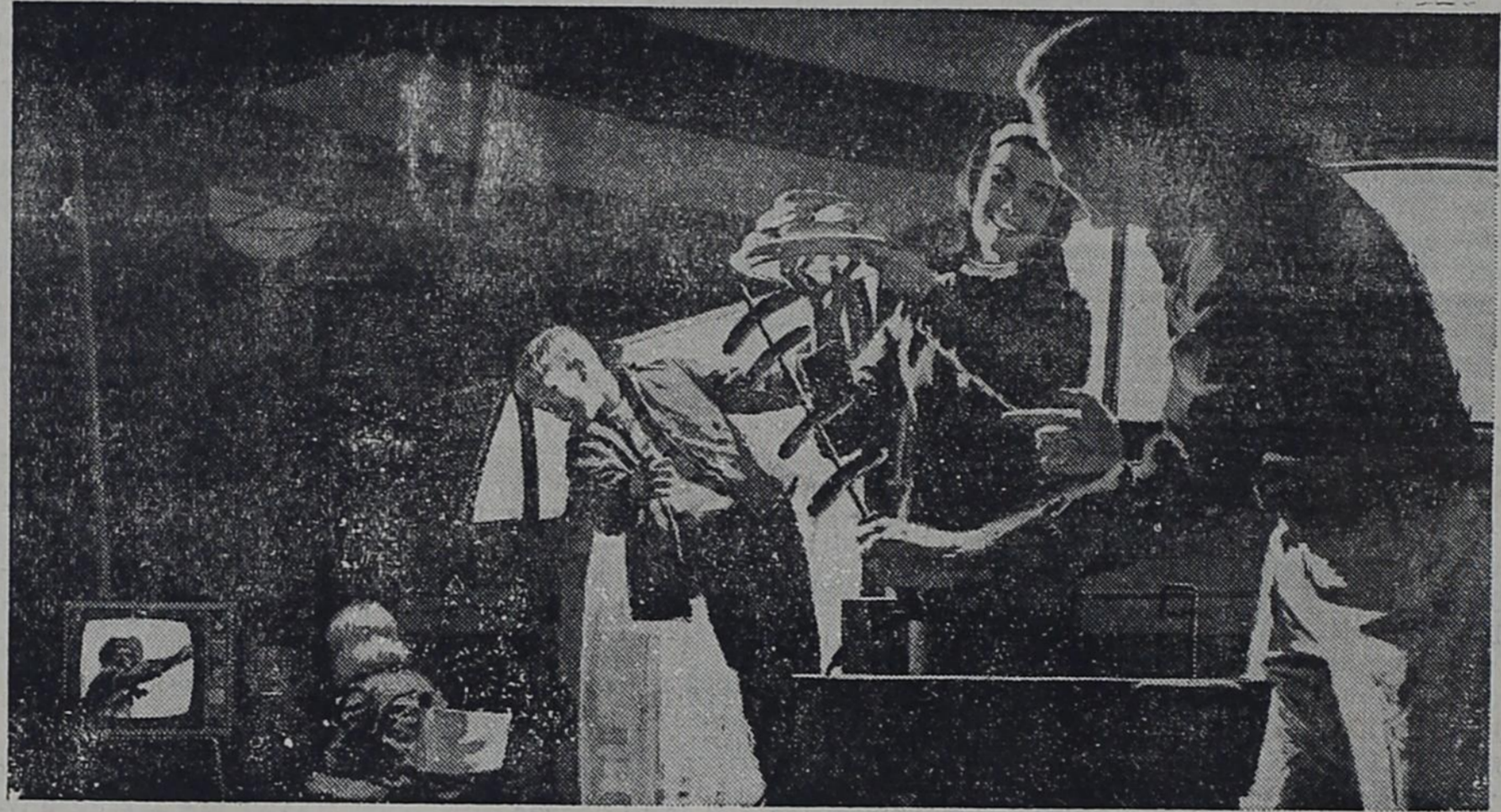
Today, abundant electric service brings modern conveniences to the campsite.

Wherever you look today, electric service makes good things possible.