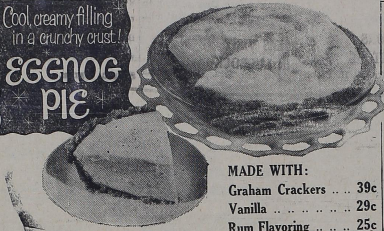
PET MILK No. H158-49-5

Cool, creamy filling in a crunchy crust! EGGNOG PIE