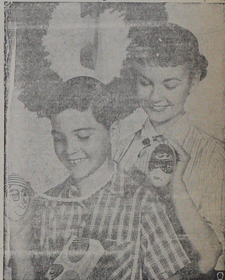
Shelley Fabares and Paul Petersen, the bright and shiny youngsters who appear each Wednesday night over ABC-TV as the teenage fledglings of the new "Donna Reed Show", have already celebrated two Christmases which are now on film awaiting your Christmas Eve viewing.

These make-believe Christmases find the kids first losing track of the true holiday spirit in a rash, cash evaluation of gifts received against gifts given! The old magic is recaptured, however, as the script takes them to the children's ward of a city hospital for a second Christmas. Aided by Buster Keaton in one of his rare TV appearances as a surprise Santa Claus, they bring their own gifts to these forgotten sick kids and Christmas becomes wonderful again.