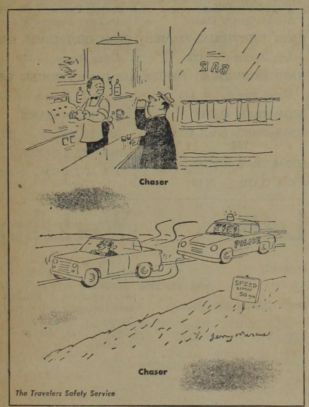
Driving after drinking is a major cause of highway accidents.