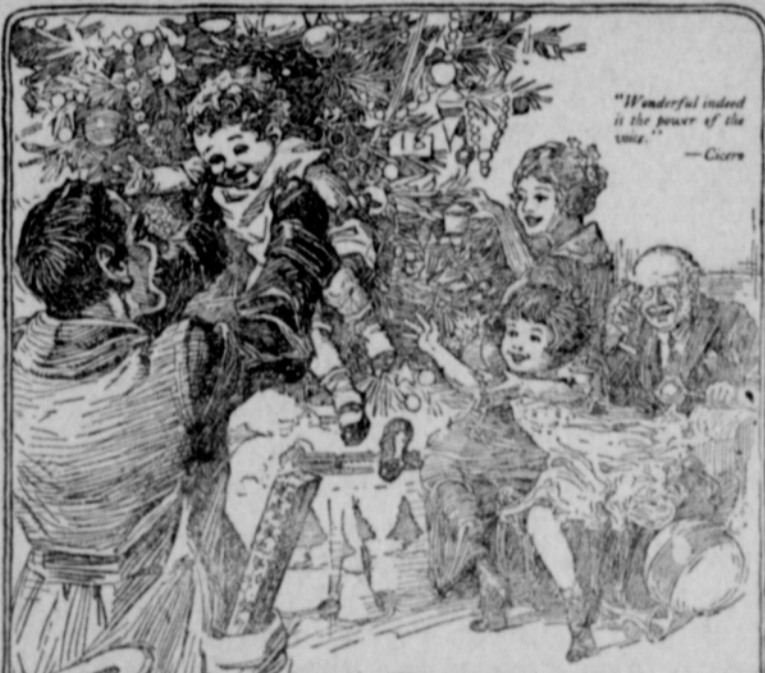
"Wonderful indeed is the power of the voice." —Cicero