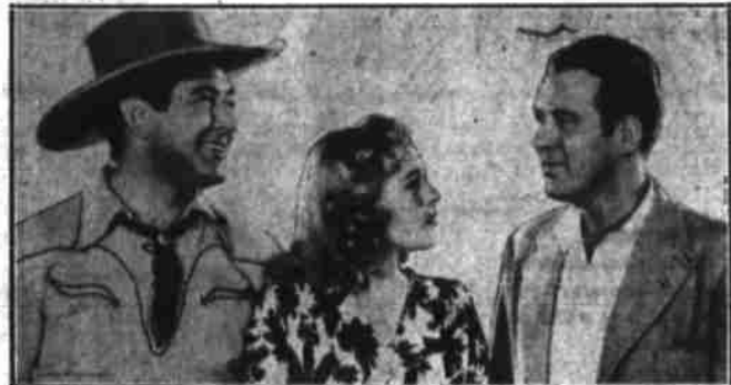
Also at the ranch is Dick Foran, whose rival for Anne's affections is Johnny Mack Brown, the foreman.