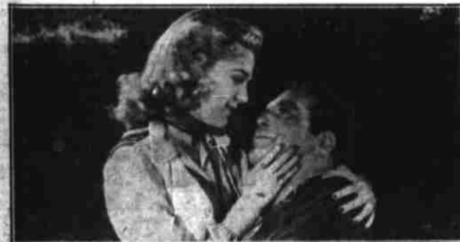
But all ends well when Dick Foran, aided by Abbott and Costello, wins the rodeo for the Lazy S team.