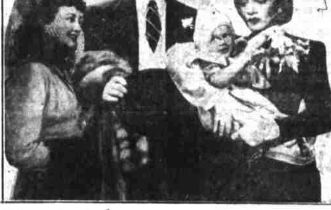
Arline Judge, Fred MacMurray, David James and Marlene Dietrich in a scene from "The Lady Is Willing."

It's an amusing, sophisticated, light comedy dealing with the problems of a Broadway star's adoption of a baby, and true to form the baby, an exceedingly cute little thing named David