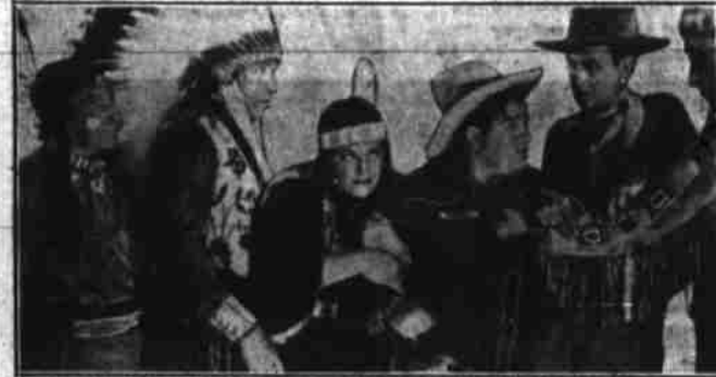
When Costello refuses to marry Moonbeam, the Chief sentences him to be burned at the stake.