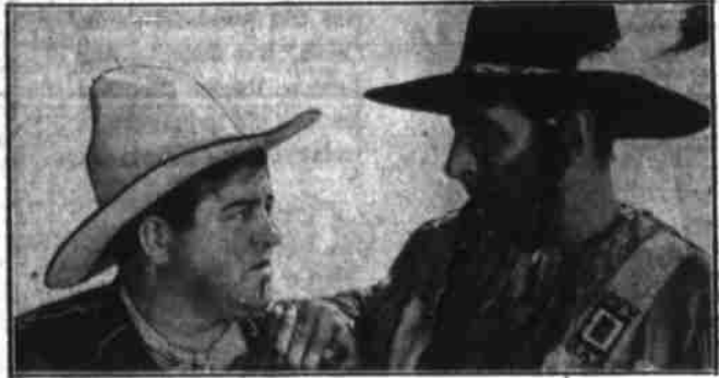
At the Lazy S Ranch Costello mistakenly proposes to Moonbeam, Chief Rainwater's daughter.