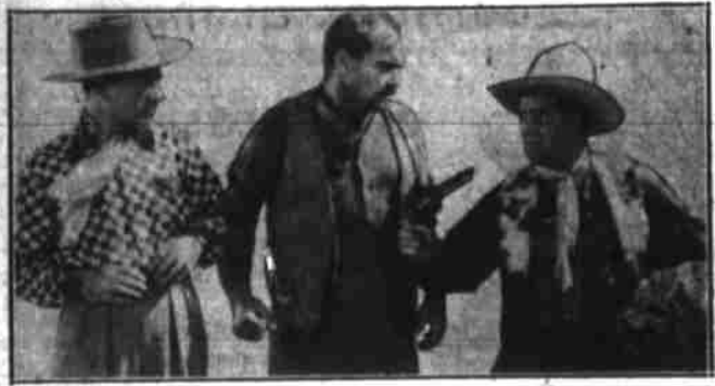
Fleeing West on a cattle train from New York, the boys win the real cowboys' clothes in a poker-game.

Universal's latest Abbott-and-Costello comedy includes Anne Gwynne, Dick Foran and Johnny Mack Brown.