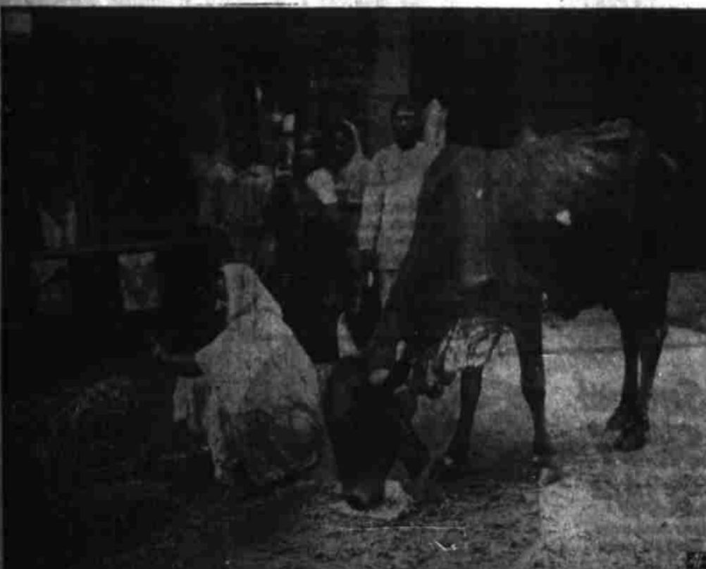
ONE OF INDIA'S SACRED COWS. —To Hindus, the cow is a sacred animal and here in Bombay—major Indian port and gateway to India—is a native woman feeding a sacred cow. Bombay, situated on a small island off the coast of western India, has excellent harbor facilities, plus good defenses, which are two items of possible interest to Japanese military strategists.