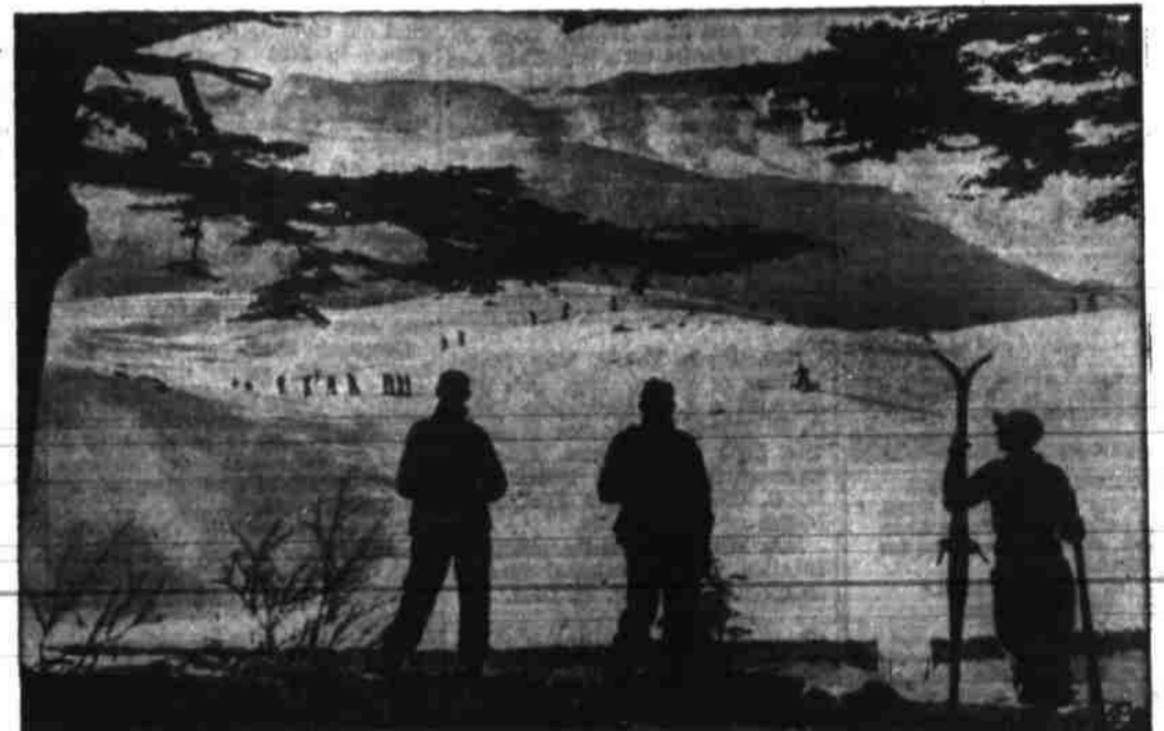
SOMBER NOTE IN PEACEFUL SCENE. —Australian ski patrol soldiers dot the slopes of Lebanon range in Syria as they train, fully-equipped, for warfare on snowy terrain.