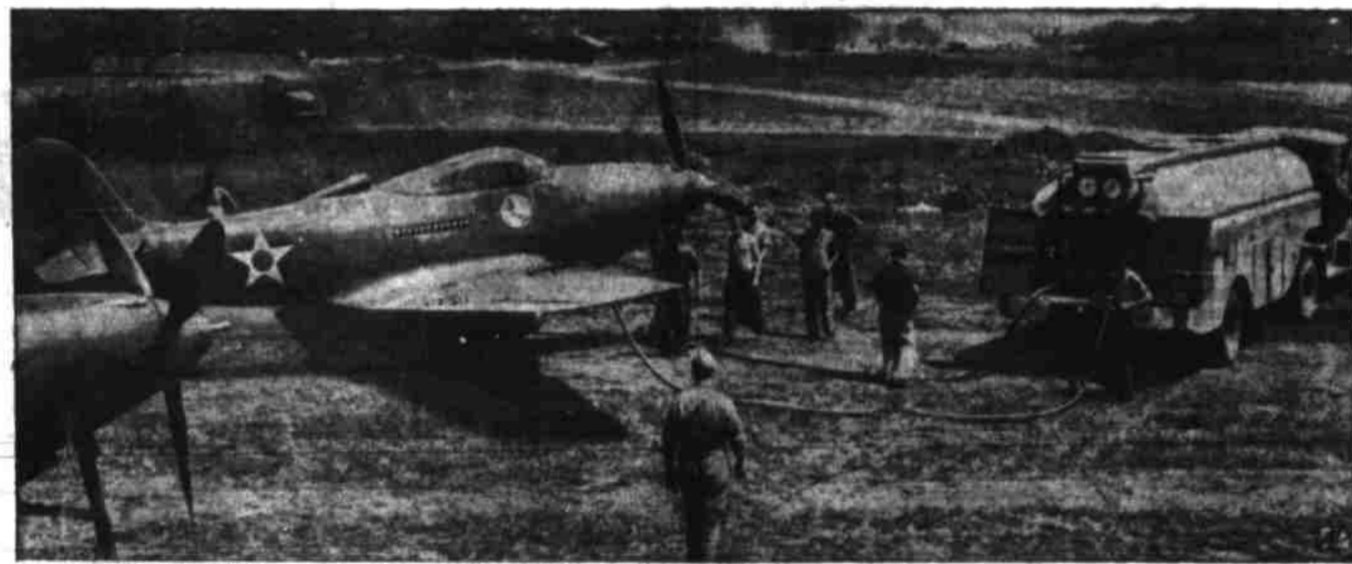
PLENTY OF GAS AND NO QUESTIONS ASKED. —At an airport lately cleared in Panama's jungle, a ground crew hurries to refuel a P-39 pursuit plane engaged in patrol of the Panama Canal area. Cashback too is also being watched.