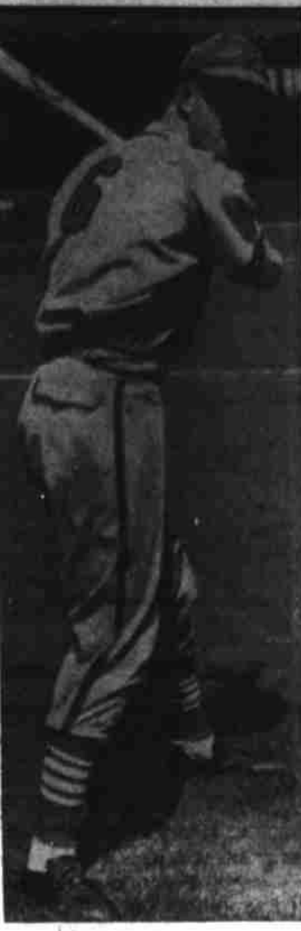
Stan Musial, young St. Louis Cardinal outfielder, is the baseball writers' candidate for No. 1 rookie-of-the-year honors in the major leagues. The sports critics base their selection on the phenomenal minor league record compiled by the 21-year-old Doonora, Pa., boy, who began his career as a pitcher—and a pretty good one—until discovery of his batting powers, plus an arm injury, rerouted him to the outfield.