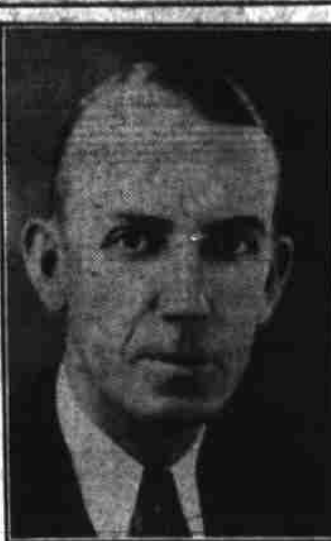
President of the South Plains Bank

WASHINGTON, April 22 (AP)—Senator Connally (D-Tex) said today the war department informed him that it had authorized "an air force training school and expansion at Kelly Field to cost in excess of $5,000,000."