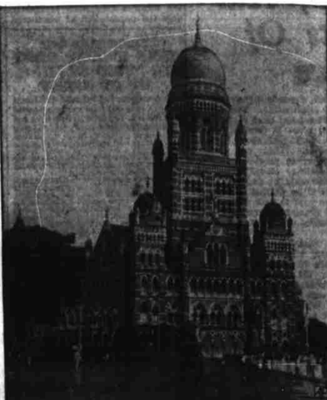
BUILDING IN BOMBAY. —One of the features of Bombay, Indian port city, is the municipal building (above), which reflects architecture favored there. Bombay's 1,200,000 population includes a large American colony interested in cotton.