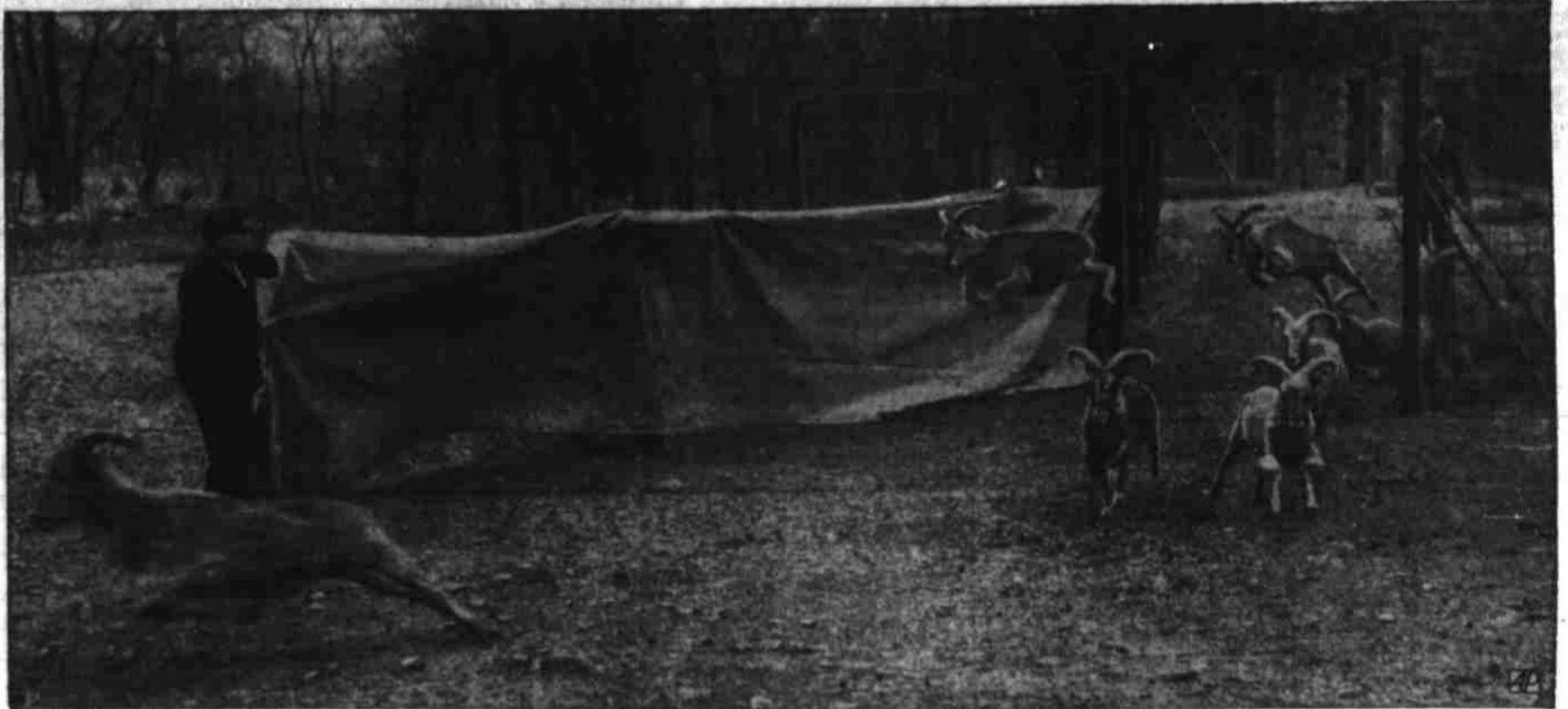
WILD SHEEP MAKE ZOO KEEPERS WILD. —They flew through the air with the greatest of ease—did these Barbary wild sheep leaping through canvas when the Bronx, N. Y., zoo staged air raid drill for its animal inmates. Three 25-foot canvas walls were used to herd them together, when they all reached land again.