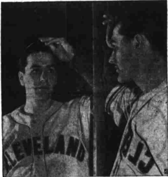
GOOD LUCK TO YOU! —Lou Bondreau, boy-manager of the Cleveland Indians who signed a two-year contract last November—he was 24 at the time—wishes his mirrored image a good season. This youngest manager in major league history succeeds Roger Peckinbaugh, who's now general manager.