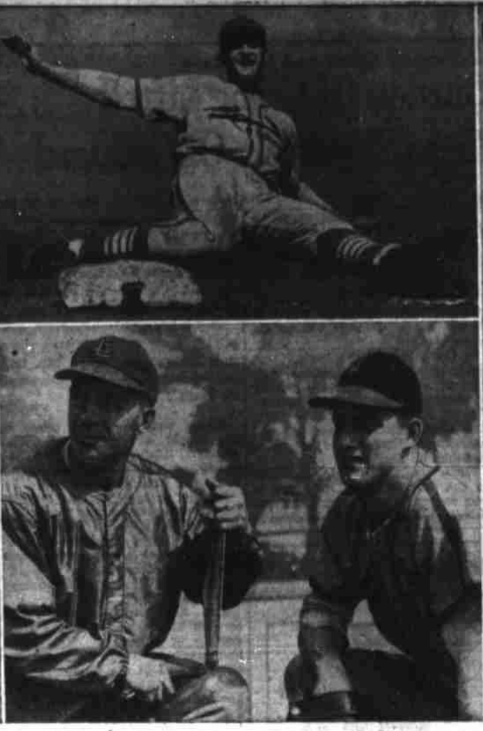
He played part time in three leagues last season, and outdid the besting champion in each. His performances in spring training exhibitions and in early National League games bore out the predictions that he would quickly earn size ratings. Here Musial shows how he operates at bat, in the field and on the base path. Manager Billy Southworth, shown with Stan in the lower center picture, believes he plucked a gem out of the rookie bag.