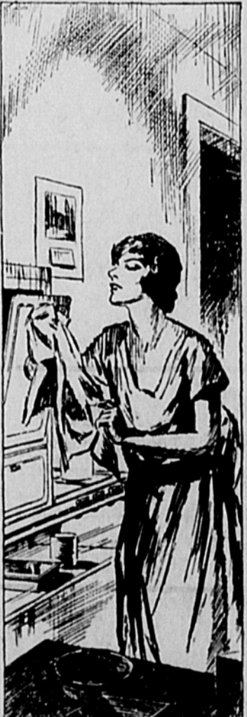
Just then . . . the telephone rang!

A wisely placed "extension" is an expert telephone often double the size of the telephone.