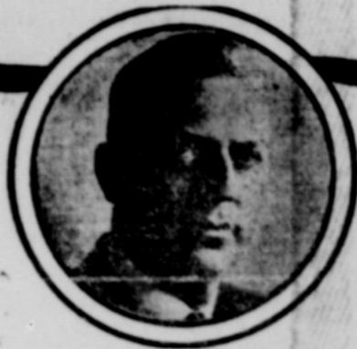
Harry A. Miller Builder of the celebrated "Miller Special"