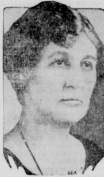
MIRIAM A. FERGUSON