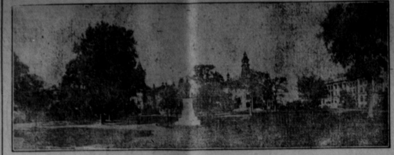
Front Campus View, Baylor University

RED CROSS PHARMACY Slaton, Texas dress P. O. Box 81, Slaton, Texas The Rexall Store