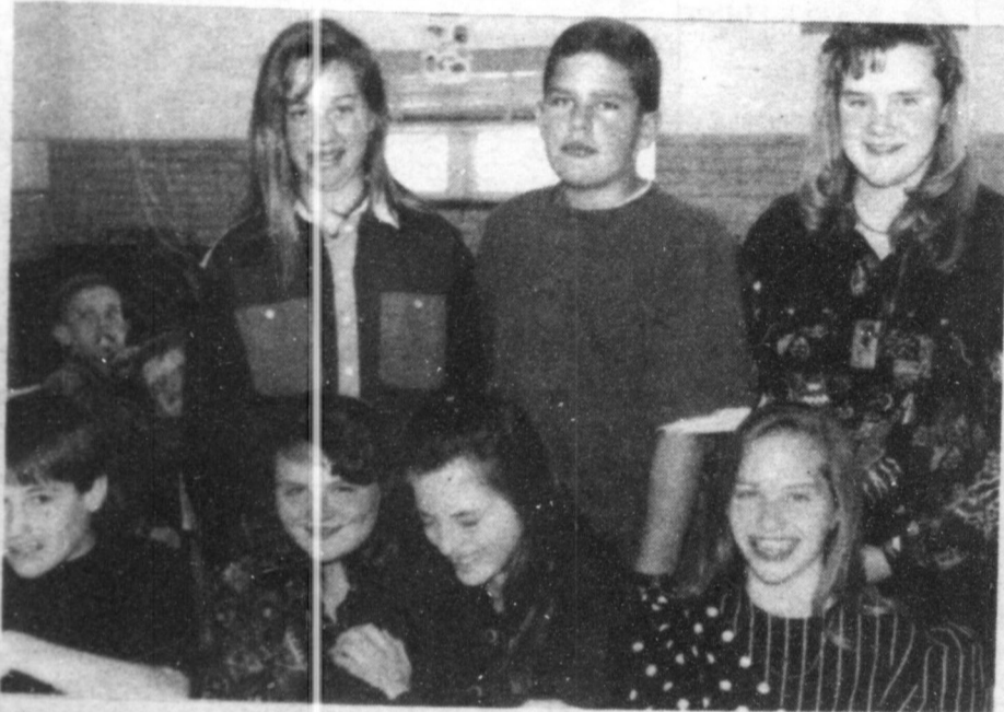
These Junior High Students were just "kickin'back" and enjoying a few snacks and a movie as they awaited their turn in the UIL Contest held at Groom last week.

Commerce Bank Building No. 5 Thursday, April 8, 1993 779-2141