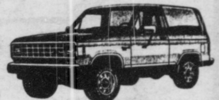
Bronco II XLT 4x4