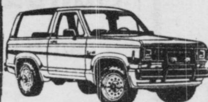
Bronco II XL Sport 4x4