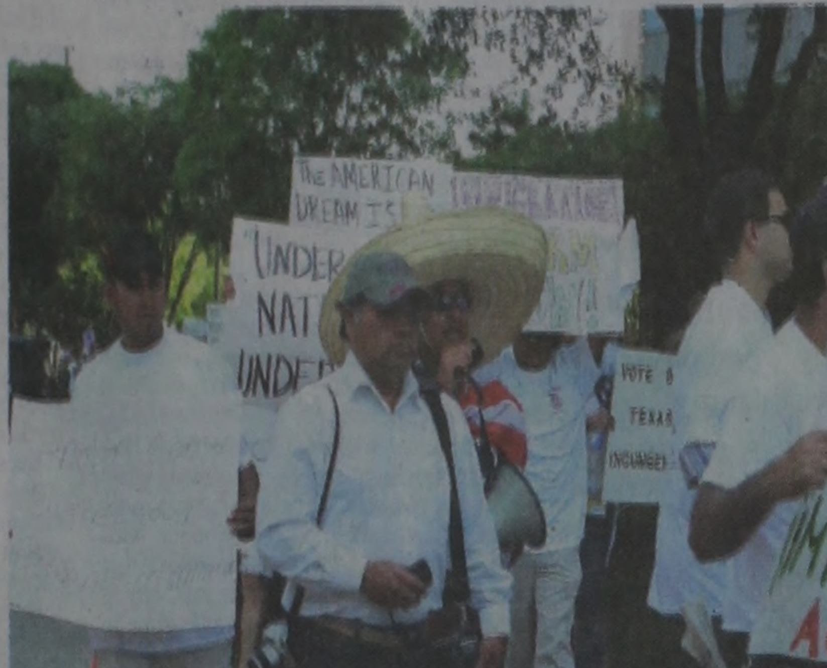
Immigration Protest outside of Cornyn's office

Cornyn continued to tie illegal immigration