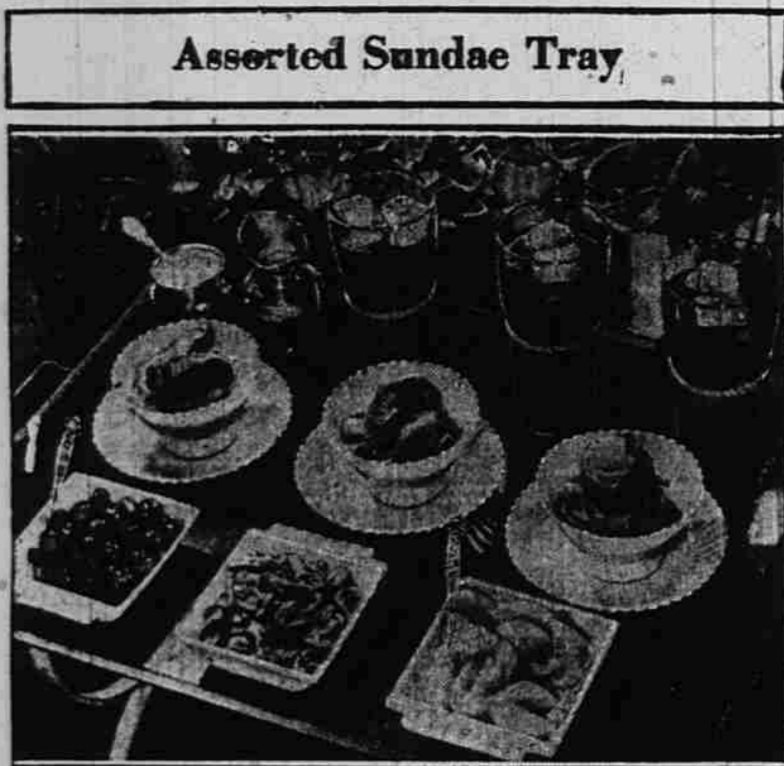
Assorted Sundae Tray