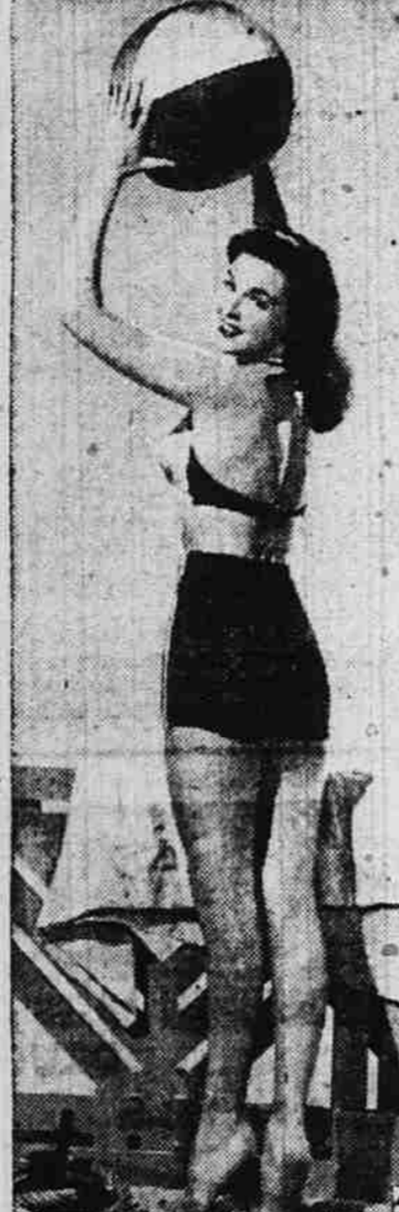
BEACH BALL - Having fun on the sand, showing off a new two-piece swim suit, is film actress Marguerite Chapman.