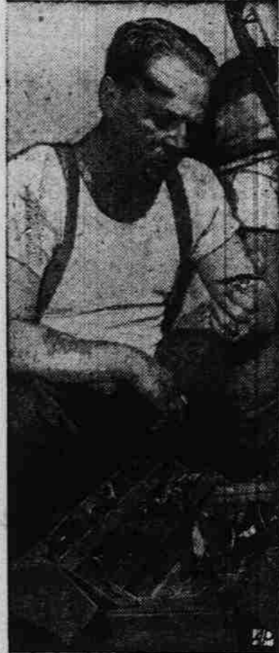
ANGLER—Comedian Whitley Ford, who ties his own trout flies and even makes some of his rods, gets ready to sally forth for a tussle with the fish around Nashville, Tenn.

Fudge Nut Cake 2 cups sifted cake flour 1 teaspoon soda 3-4 teaspoon salt 1-2 cup vegetable shortening 3-4 cup brown sugar, firmly packed 1 cup milk 1 teaspoon vanilla 3-4 cup corn syrup or honey 2 eggs, unbeaten 2 squares unsweetened chocolate, melted 1 cup coarsely chopped nut meats Sift flour once; measure into sifter with soda and salt. Have shortening at room temperature; mix or stir just enough to soften. Sift in dry ingredients. Add brown sugar (force through sieve to remove lumps, if necessary). Combine milk, vanilla and syrup. Add one-third of liquid and the eggs to dry ingredients. Mix until all flour is dampened; then beat 1 minute. Add remaining liquid. Blend. Then add chocolate. Add nuts. late and beat 2 minutes longer. Turn batter into 13x9x2-inch