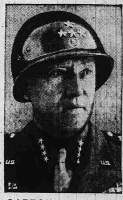
PATTON—This portrait of Gen. George S. Patton, Jr., wearing his four-starred helmet and campaign ribbons, was made at his last press conference in the ETO.