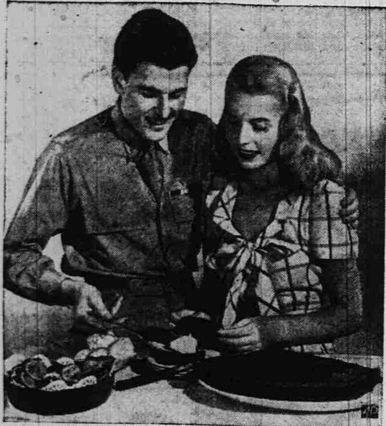
HOME, SWEET HOME... Fudge cake at homecoming.