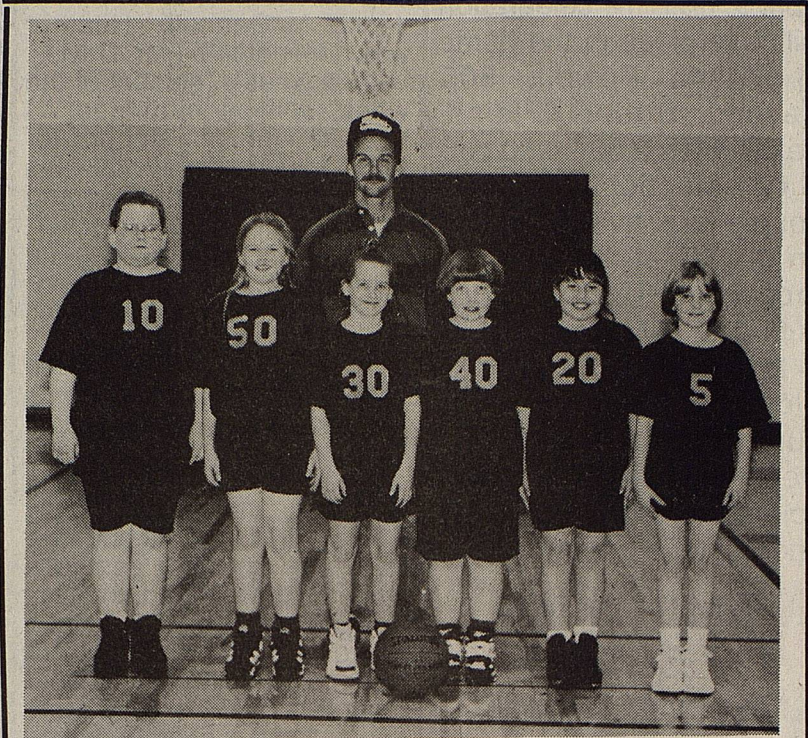
Team Name: Ice Cubes