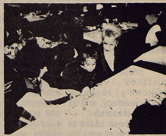
Plains Kindergarten had special lunch guests at the school cafeteria recently. The Letter M had been studied, and each child invited their Moms and grand Moms . Tables were decorated with their drawings.