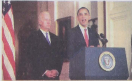
President Barack Obama makes a statement to the nation Sunday night following the final vote in the House.

Obama was proud but not unrestrained in victory, mindful that the Senate still has not gotten to a companion bill to fix