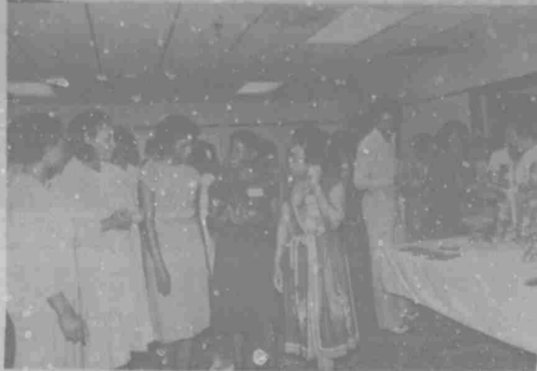
BLACK TEACHERS HOLD RECEPTION - Black teachers of the Lubbock Public Schools held their first reception Sunday afternoon, September 20, at First Federal Savings & Loan. Pictured above are some of the Black teachers who were in attendance at the affair.