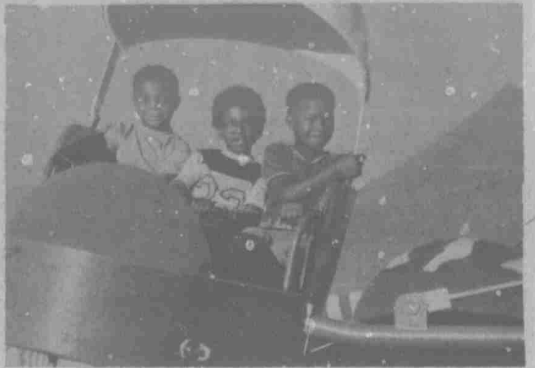
ENJOYING THE 64TH ANNUAL PANHANDLE SOUTH PLAINS FAIR - These young people are enjoying themselves riding the various rides. The weather has been great this week, and thousands of Lubbockites have taken advantage of this year's event.