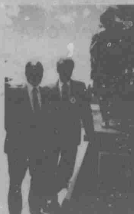
heroic but seldom recognized contribution to the nation's air war effort, the statue was made possible by contributions from many individuals and companies such as Philip Morris Companies Inc. and General Foods.

The memorial, an eight-foot bronze statue of a black World War II fighter pilot looking toward the heavens, will stand permanently in the Honors Court of the Academy along with only two other statues. A tribute to the