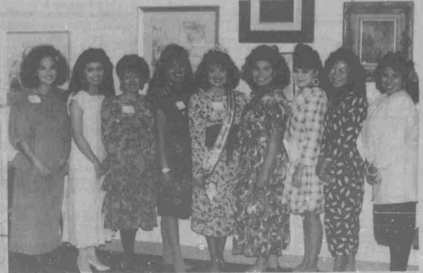
These lovely young ladies are vying for the title of "Miss Fiesta 1988." The Southwest Digest is