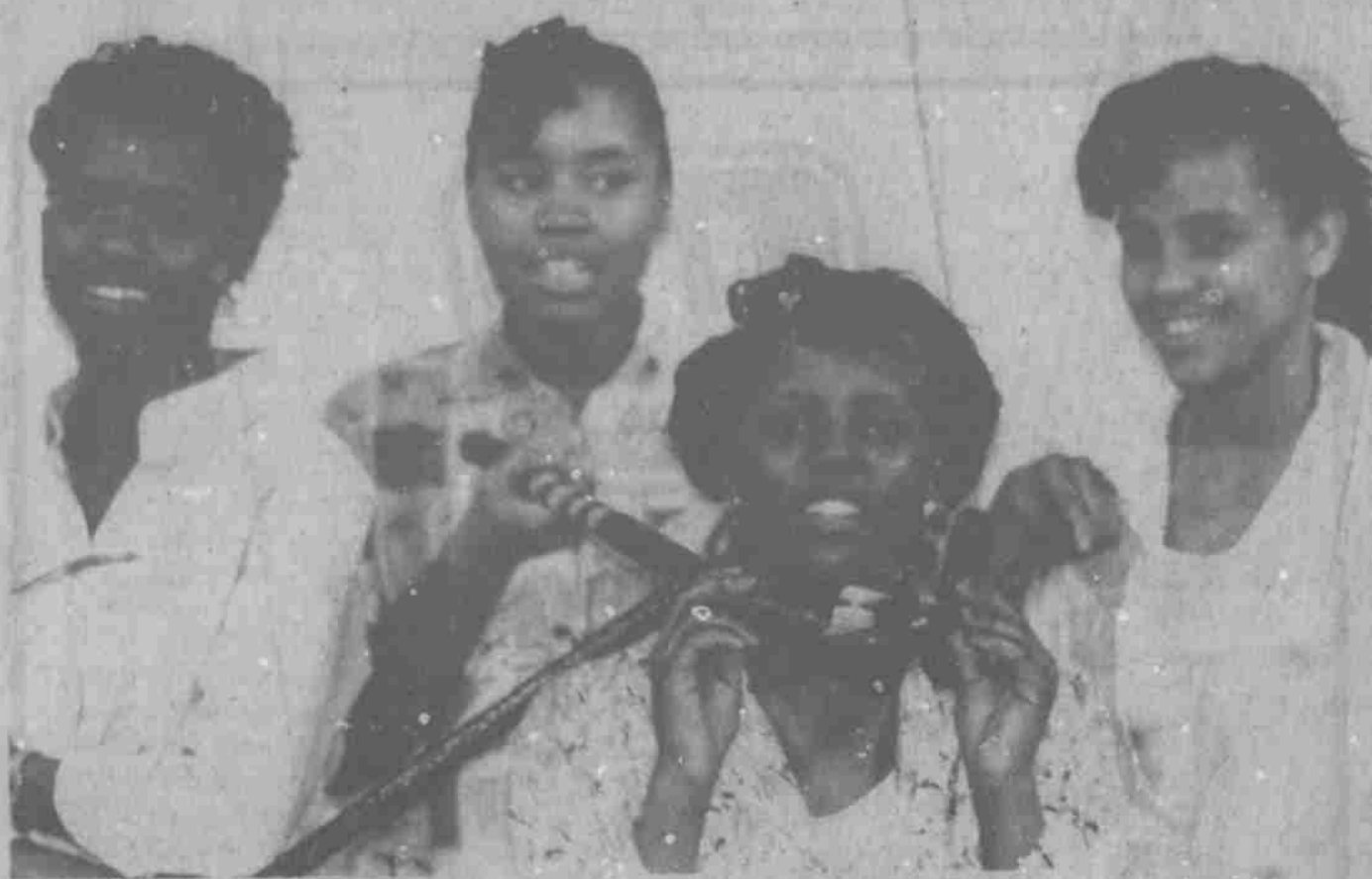
Shown here are the members of the hot high school dance act, Candy Cane. They will be competing in this year's Springfusion Talent Showcase May 1, 1987 in the Lubbock Memorial