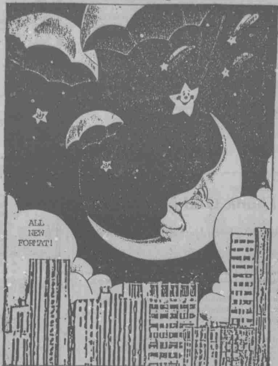
This 3rd Annual Springfusion Showcase is brought to you by Koda Historical Arts Council.