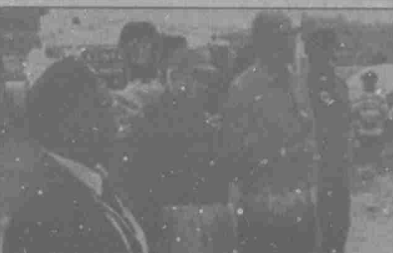
Negro Airmen International, Inc. 41st Annual Memorial Day Fly-In, "From Selma to Tuskegee, Making an Economic Impact"

Thanks to all of them for all have done for all of us!