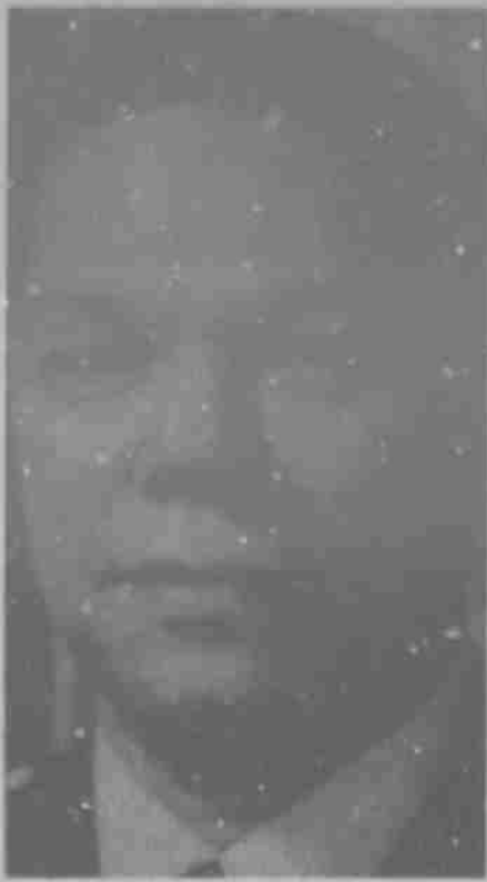
A rousing presentation by Gen Colin . Powell delivered in Philadelphia at the GOP nominating

convention would have been an appropriate ending for the four day event.