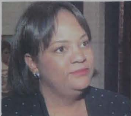
Dr. Regina Benjamin holds advanced degrees in medicine and business administration.

WASHINGTON (CNN) — President Obama announced Monday he has chosen Dr. Regina Benjamin, a family practice doctor from the Gulf Coast, to serve as surgeon general.