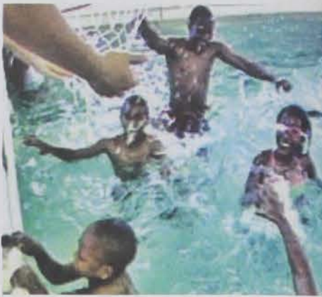
For kids in the summertime, there's nothing better than jumping full-speed into a pool to cool off. So when 65 kids from a Northeast Philadelphia camp were banned from taking a dip at a private swim club.