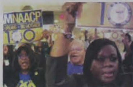
The NAACP has launched a program that lets people use their cell phones to report incidents of police misconduct.

NEW YORK (AP) — Combining its century-old mission of fighting for equality with the instantaneous reach of modern-day technology, the NAACP has launched a program that lets people use their cell phones to report incidents of police misconduct.