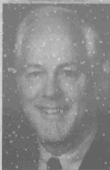
Ask Attorney General John Cornyn