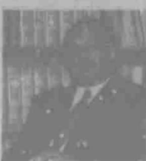
For even Christ pleased not himself; but, as it is written, The reproaches of them that reproached thee fell on me." Romans 15:3.