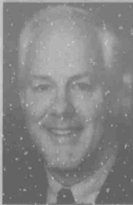
Ask Attorney General John Cornyn