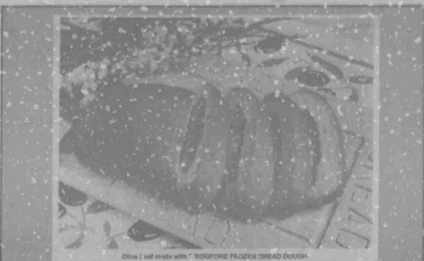
Olive Loaf made with BRIDGFORD FROZEN BREAD DOUGH

For more information on the Crime Victims' Compensation Fund, visit our Web site at www.oag.state.tx.us . You can download an application form through the Crime Victim Services section of our Web site. You can also request an application by calling (800) 983-9933 or (512) 936-1200 in the Austin area.