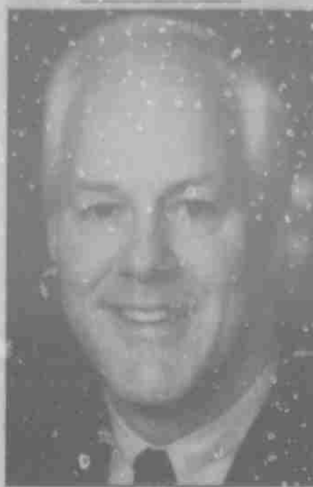
Ask Attorney General John Cornyn