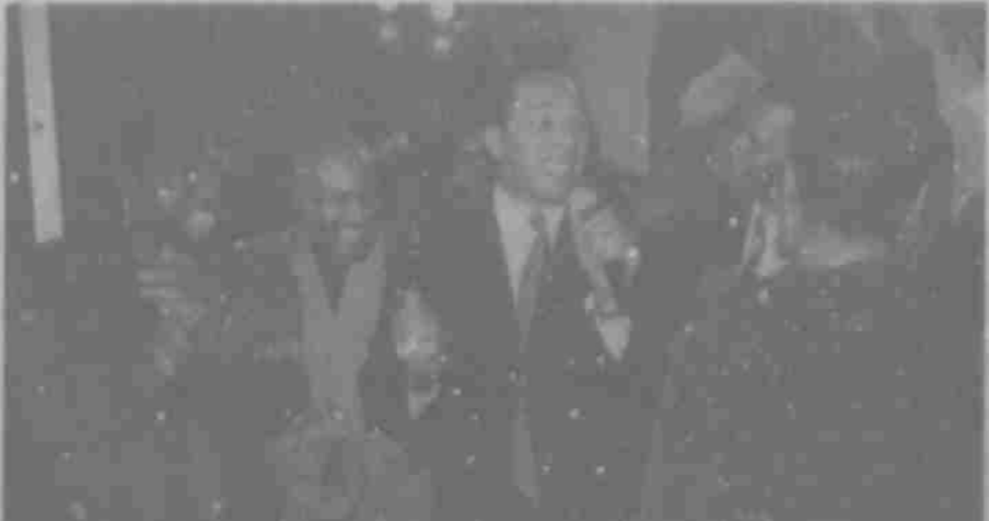
Photo 3. L-R, The O'Jays' Eddie Levert and Walter Williams sing Stand By Me with Betty Wright at the party.