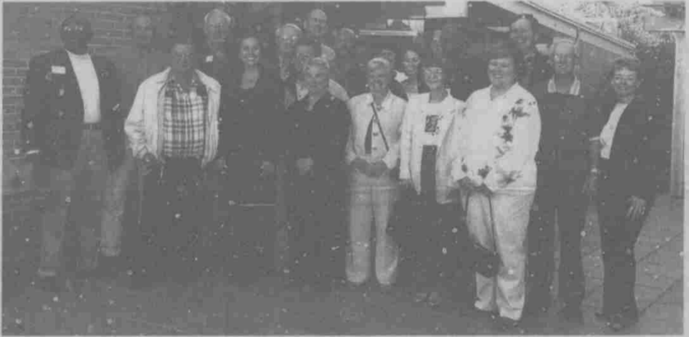
Below: EENR members gathered in Bellevue, Washington to exchange ideas about preserving and appreciating the natural resources in their respective cities.