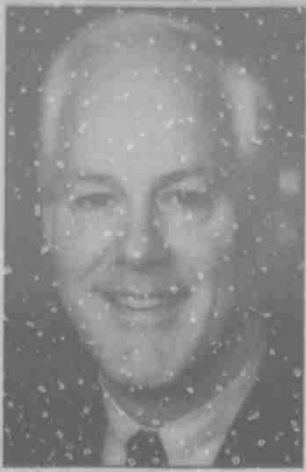
Ask Attorney General John Cornyn