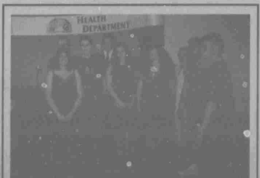
City of Lubbock Youth Commission at Press Conference Pictured above are the young people of the City of Lubbock Youth Commission who had a press conference explaining their concern for sex education in Lubbock. At this time, they are trying to educate the young people of the community.