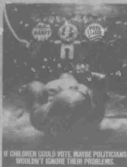
IF CHILDREN COULD VOTE, MAYBE POLITICIANS WOULDN'T IGNORE THEIR PROBLEMS.

But its budget will result in 114,000 fewer children in working families getting federal child care assistance despite long child care waiting lists in many states. "At the 2000 Republican National Convention, Secretary of State Colin Powell eloquently stated: 'We are obliged to make sure that every child gets a healthy start in life. With all of our wealth and capacity, we just can't stand by idly.'" The administration's 2002 and 2003 budgets leave millions of uninsured children behind including immigrant children and thousands of children with disabilities whose parents cannot get them needed treatment.