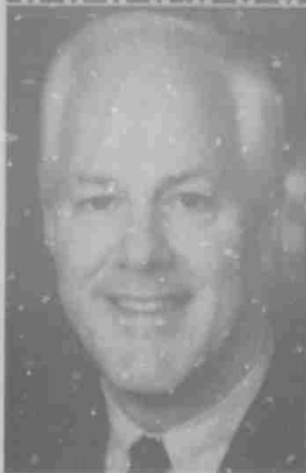
by Attorney General John Cornyn